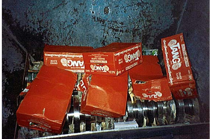
Photo caption: Outdated Consumables entering the pre-shredder at Conigliaro Industries, Framingham, MA.

Destruction is their business, and business is good.