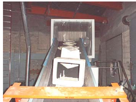
Computer Shells head for Conigliaro Industries' Herbold Granulator - to be ground to 1/8" minus.

Conigliaro will also videotape or photograph the process, and provide a certificate of destruction. Sometimes, clients send an observer to make sure the destroyers don't help themselves to a free T-shirt or coupon. "Our employees are very good about that," Greg Conigliaro says.