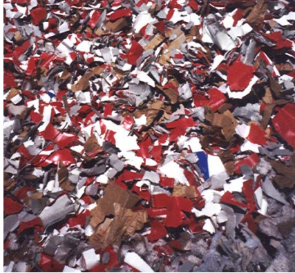
Computer manuals, "once shred" by Conigliaro Industries AZ-80 Shredder.

"It was directly tied to when we added bigger shredding machines for recycling operations," he says. "We offer this as a side benefit for our customers."