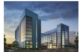
Enterprises & institutions