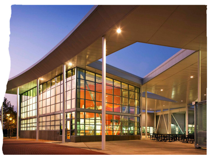
ATC High School, c. 2018