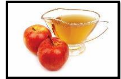
Natural Ingredient: Apple Cider Vinegar