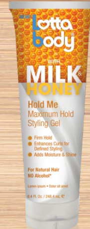
Hold Me Maximum Hold Styling Gel