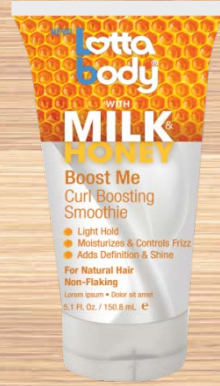
Boost Me Curl Boosting Smoothie