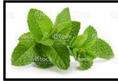
Natural Menthol: Mint