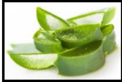
Natural Ingredient: Aloe