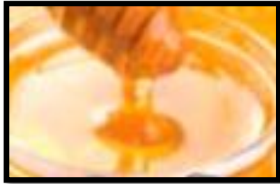
Natural Ingredient: Pure Honey