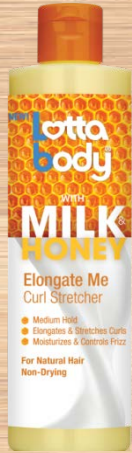
Elongate Me Curl Stretcher