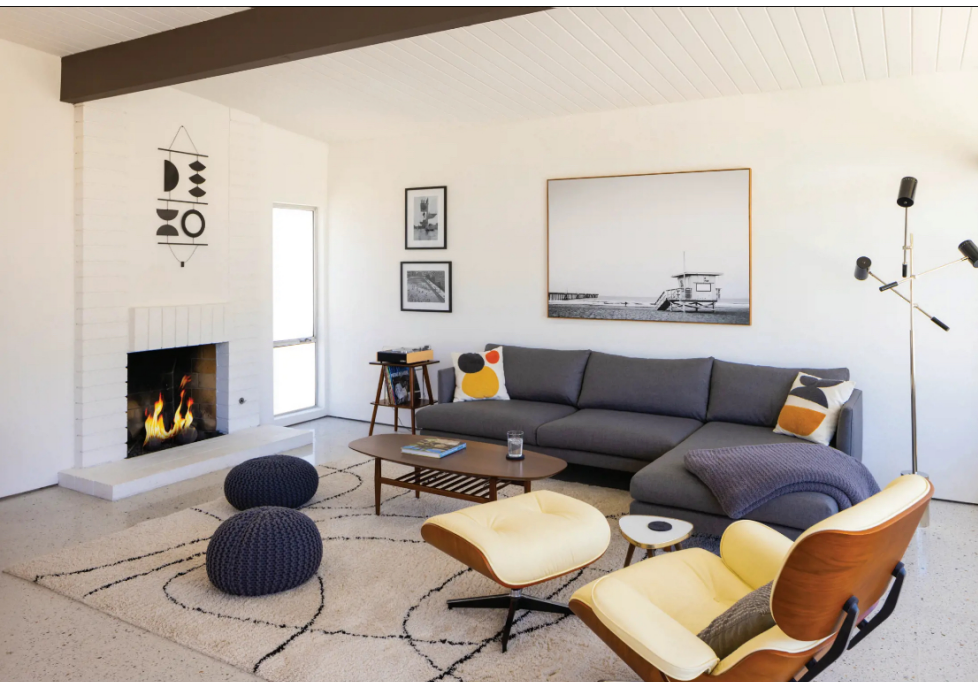
SIMPLE YET REFINED, THE LIVING SPACE IS A FAMILY FRIENDLY ENVIRONMENT THAT ISN'T FUSSY AND CAN ADAPT EASILY FOR GUESTS.

Tucked away in the iconic Little Beverly Hills neighborhood of Palm Springs sits a once-neglected Palmer & Krisel home. Today, it is a lovingly restored testament to their understated brilliance and architectural genius.