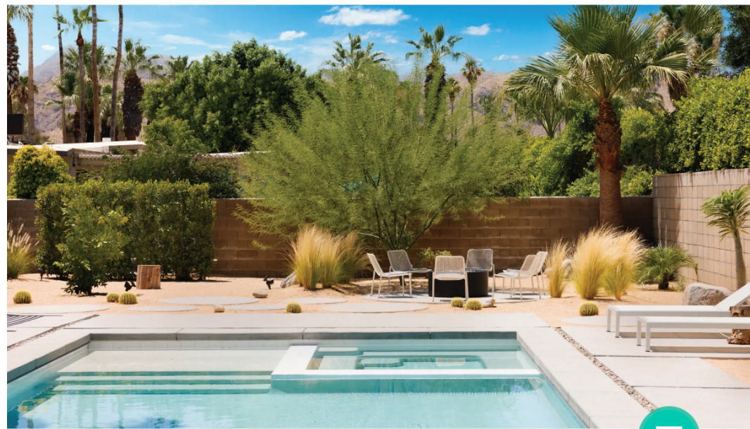
BELOW: "IT'S NOW THE PERFECT PLACE TO RELAX AND ENTERTAIN, WITH A VIEW OF THE MOUNTAINS THAT FEELS LIKE IT'S PART OF THE LANDSCAPE," VICTOR SAYS OF THE BACKYARD.