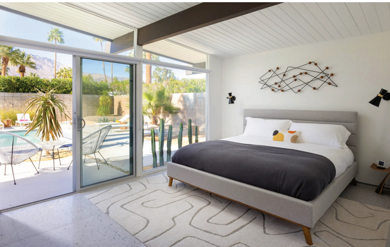
THE ART ABOVE THE BED IS BY DIEGO OLIVERO AND SOLD BY WEST ELM. IT ADDS A PERSONAL TOUCH TO THE SPACE. "THE ART BRINGS A SENSE OF WARMTH TO THE ROOM WHILE STILL FEELING MODERN AND IN TUNE WITH THE HOME'S DESIGN," DANIELA SAYS.

The original footprint and spatial flow were carefully preserved. "Every detail was considered," Victor notes. "For example, we kept the open floor plan and large windows, which blur the lines between the interior and the spectacular desert landscape outside."