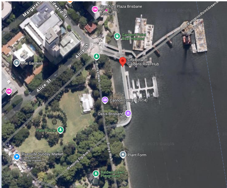
New Farm Park River Hub