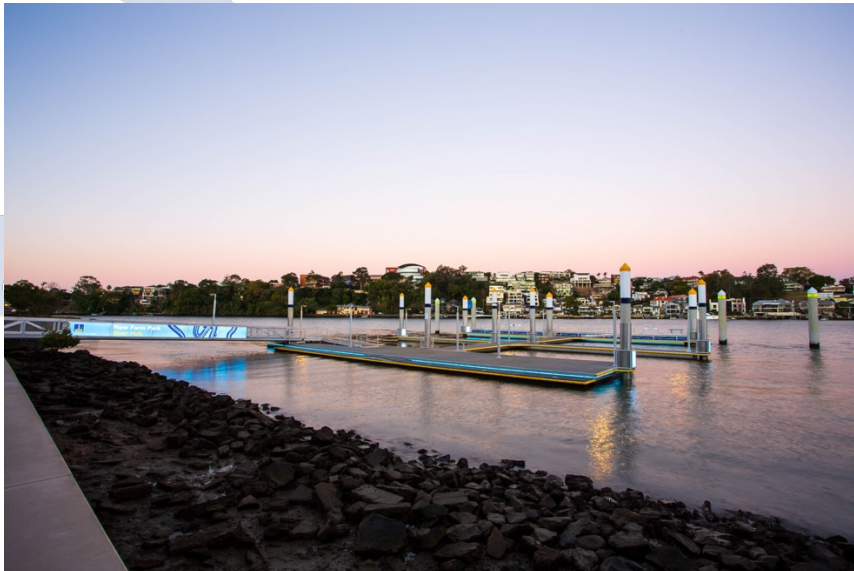
City Botanic Gardens River Hub