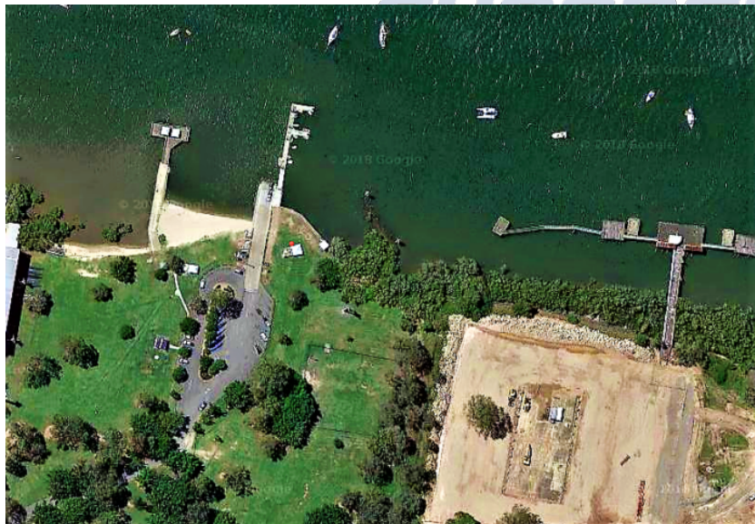
Colmslie Recreation Reserve: Family and Dog-friendly Park in Morningside