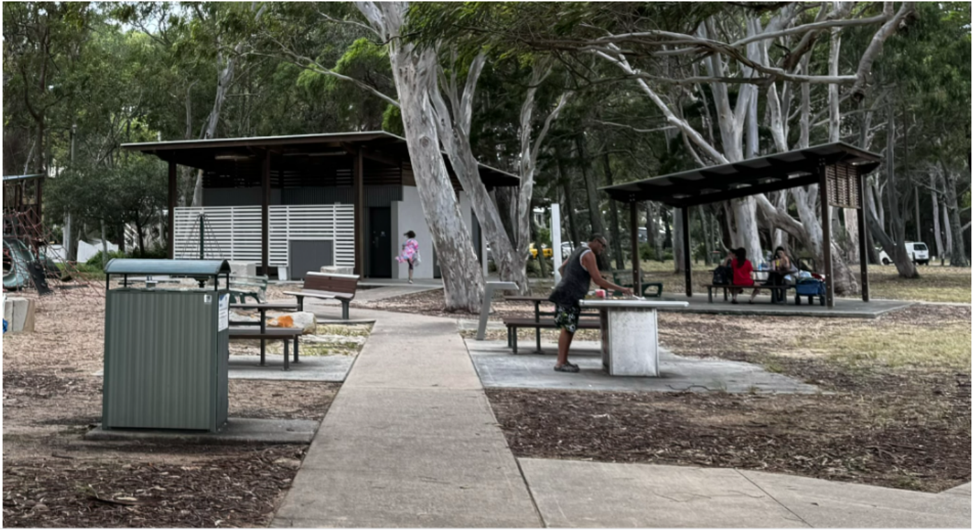
PARK WITH BBQ AND TOILET FACILITIES