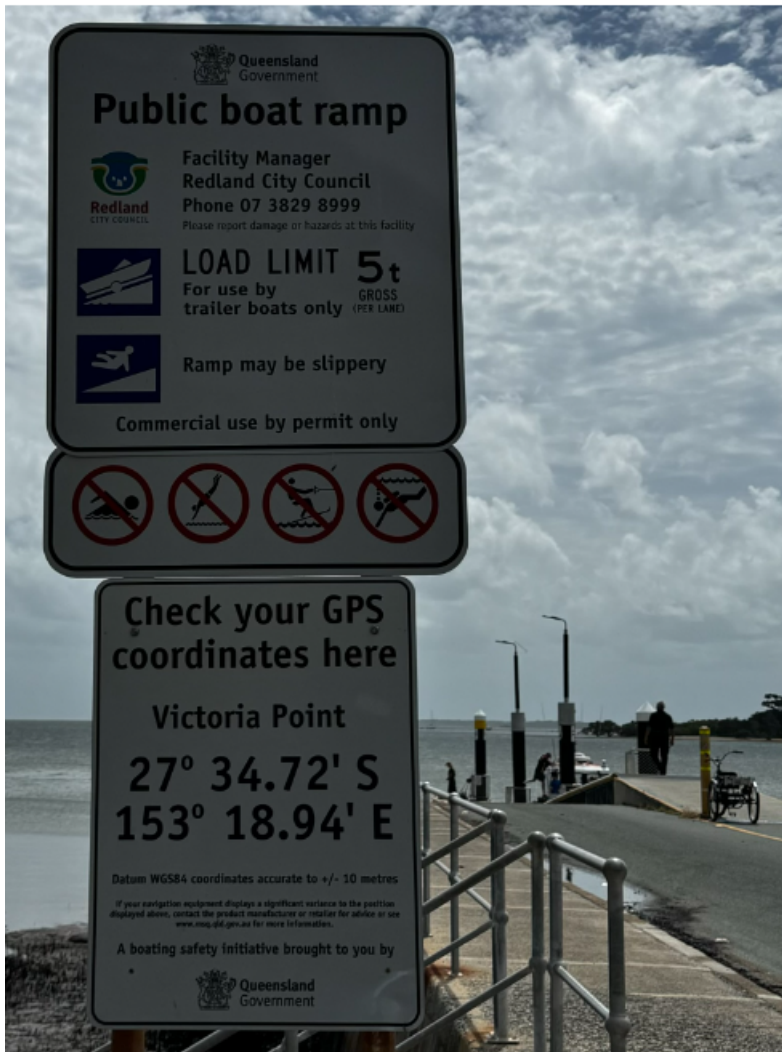
VMR BOAT RAMP AT VICTORIA POINT