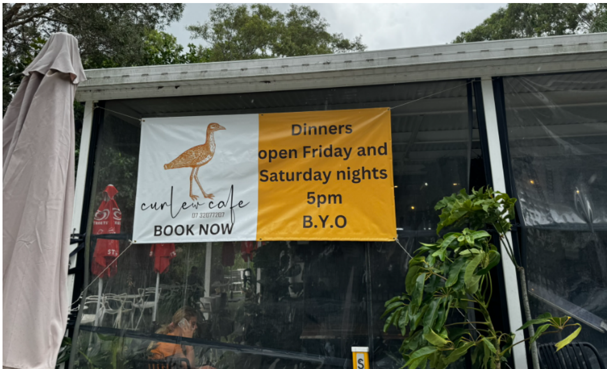
CURLEW CAFÉ – LUNCH AND BASIC SUPPLIES