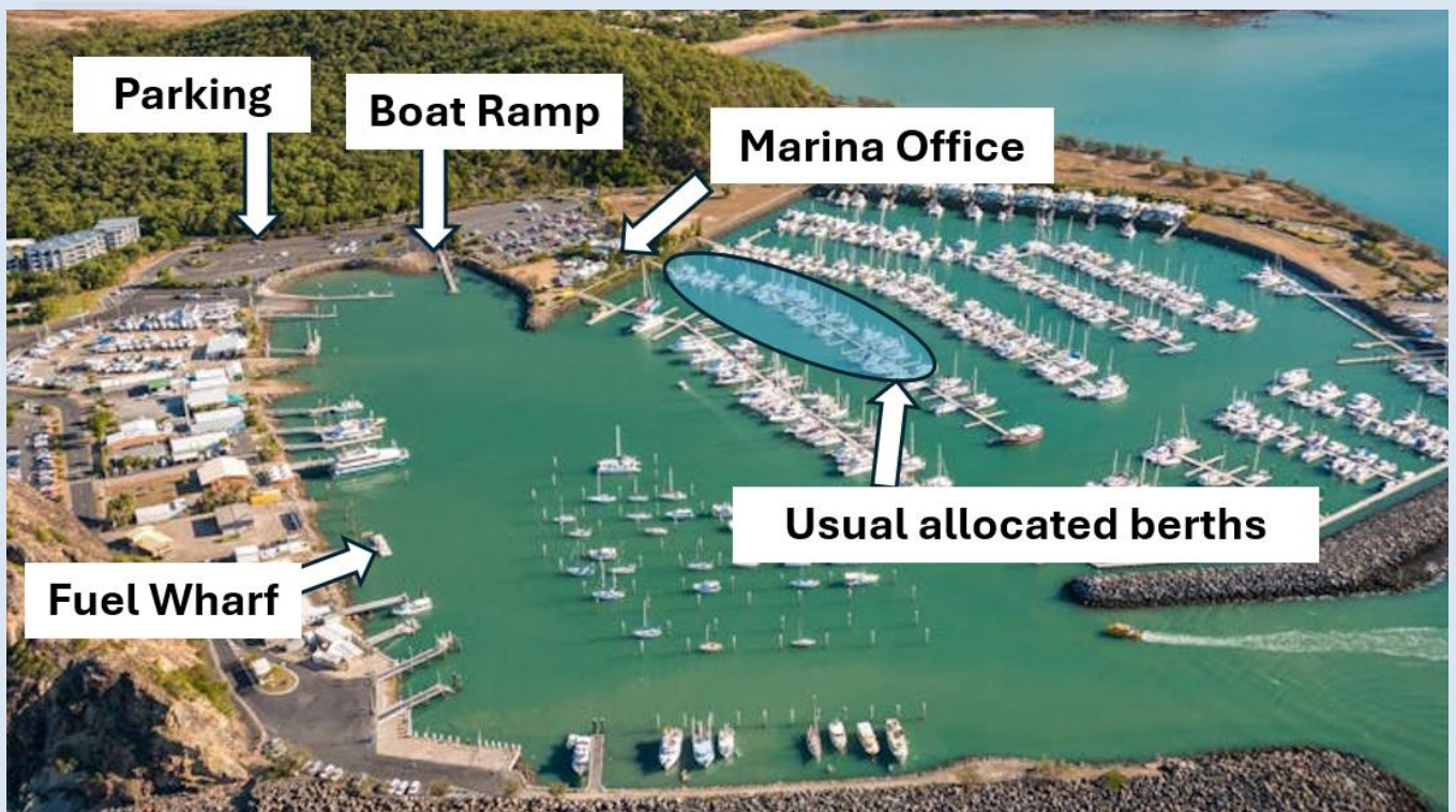
Rosslyn Bay Marina

See below map highlighting main features of the Marina facility.