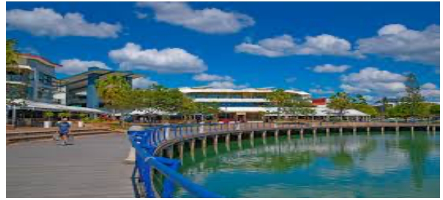
Restaurant precinct, Cleveland

We can tender around to the restaurant precinct on the boardwalk where there are a variety of eating places.