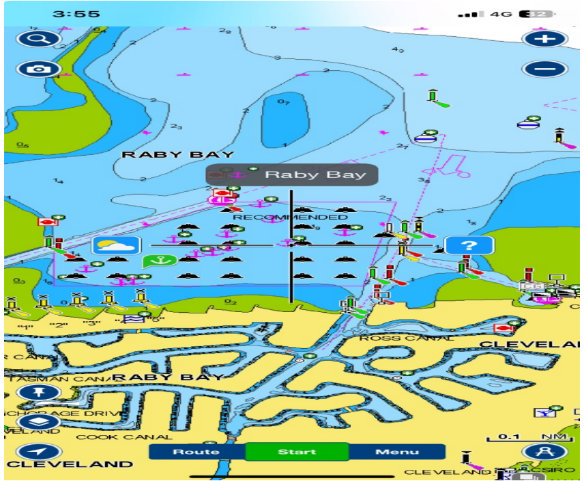
Friday Night anchorage

For those that can make it on Friday night the 15<sup>th</sup> of November we will launch at Raby Bay as usual and for something different we will anchor in front of the Raby Bay Foreshore Park (good in a southerly wind) for the night.