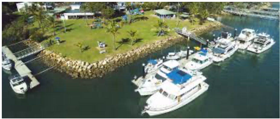
Little Ships Club

In the event of Southerly winds which might make sleeping on the boats uncomfortable, at Peel Island, we can have Saturday at Blakesleys Anchorage, a sheltered beach just south of Dunwich, with options to still come up to Dunwich for Little Ships Club or The Straddie Brewing Company in the afternoon.