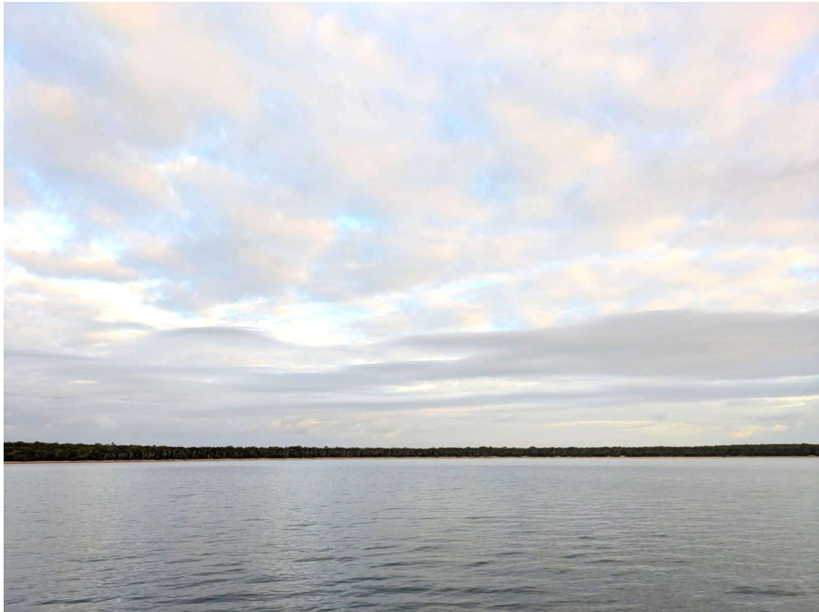
Horseshoe Bay 5.50am