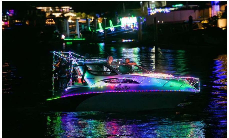
Lady in Red