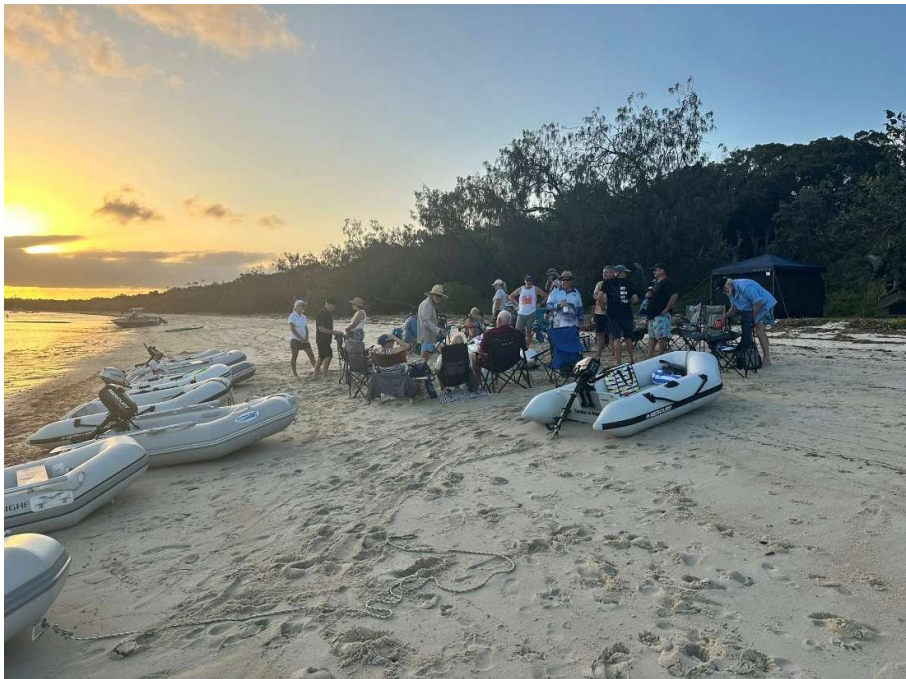
Sundowners Peel Island