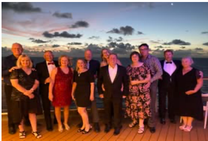
A change from boating attire...think we scrubbed up ok!