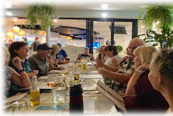
Happy raffle prize winners