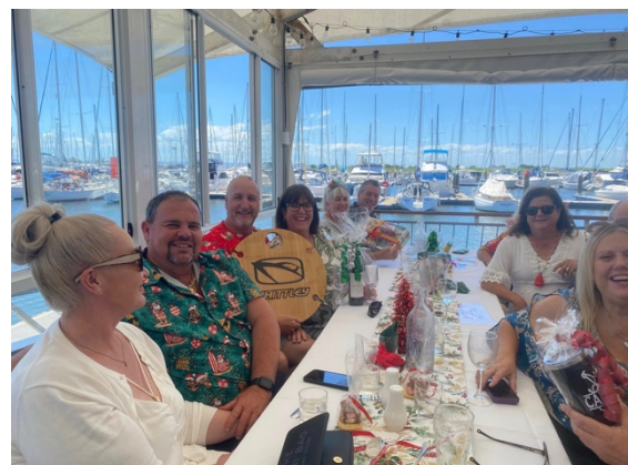
This was the table to be at....