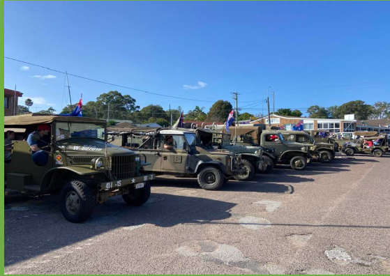
Some of the many vehicles in the Anzac parade at Wangi

A first for us Queenslanders was learning how to do a 'back to back' raft up. It was lots of fun and allowed for a social evening from our boats in the wilderness.