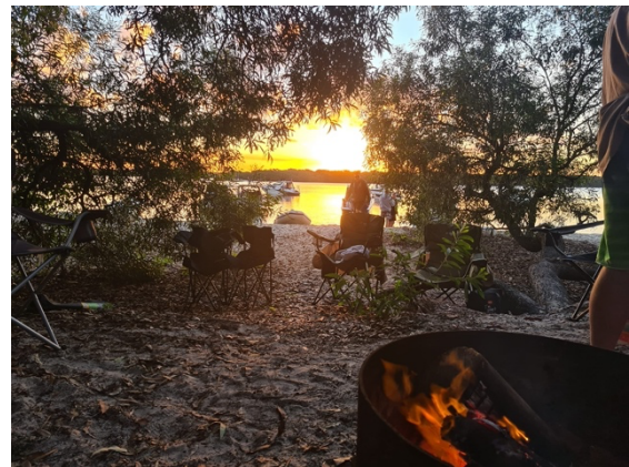
Always glorious sunsets at Tipplers