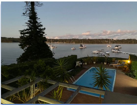
The view from the Shaw residence