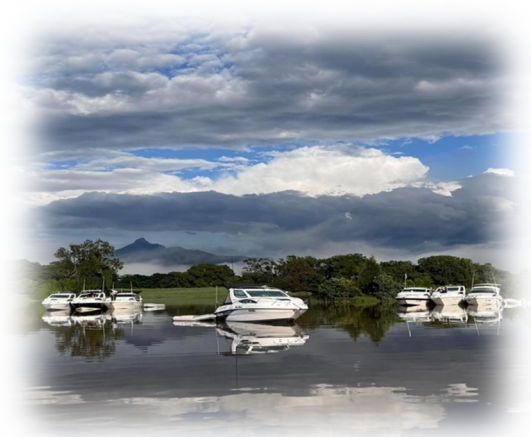
Beautiful scenery and sunshine for trip home!