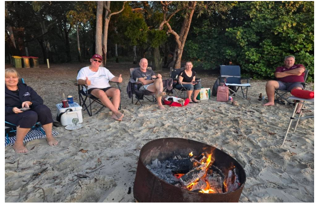
Campfires and sunsets at Tipplers