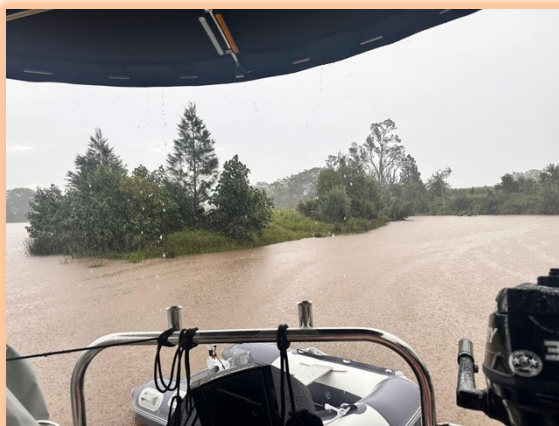
Where has the beach gone???