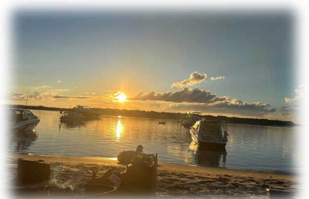
Just a few pics to prove the sun did come out!