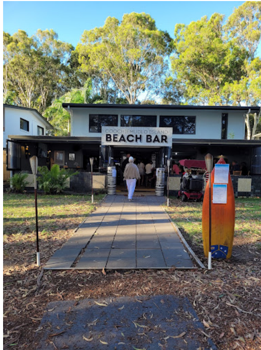
Coochiemudlo Beach Bar