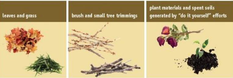
If you don't see a recyclable item pictured here, it is because it is not recyclable, so please don't include it. When in doubt, throw it out!

Set out yard waste at the curb the night before your designated yard waste collection day using Paper Lawn & Leaf Bags or set out loose in a labeled 20-32 gallon bin (preferably brown). To label your bin, use yard waste decals or write "Yard Waste" in permanent marker. Brush and small branches (less than 2 inches in diameter) must be cut up to fit inside the bin or paper bag. Otherwise, tie into bundles that don't exceed 4 feet in length and 2 feet in width.