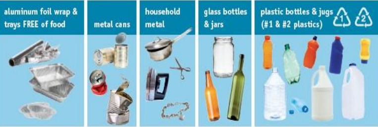
If you don't see a recyclable item pictured here, it is because it is not recyclable, so please don't include it. When in doubt, throw it out!

Hazardous waste, volatile materials, propane tanks, gas tanks, bricks, asphalt, concrete, granite, marble, toilets, all porcelain fixtures, stone and stoneware, lime, asbestos, automobile parts (engines, transmissions, rear ends, auto body parts, etc.), pipes, paint cans with liquid, infectious and/or biological waste, logs or wood longer than 3' feet and larger than 2" in diameter, chain link fencing and cables, scrap lumber and other debris resulting from the construction or renovation of premises by Contractors.