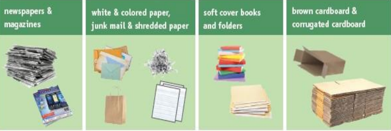
If you don't see a recyclable item pictured here, it is because it is not recyclable, so please don't include it. When in doubt, throw it out!

The night before your designated recycling day, set out paper recyclables at the curb in 30-55 gallon CLEAR plastic bags or a labeled 20-32 gallon recycling bin (preferably green). To label your bin, use paper recycling decals or write "Recycle: Paper" in permanent marker. Break up and flatten corrugated cardboard boxes into pieces small enough to fit in and then fall out of recycling containers when emptied by collection workers. Otherwise empty, flatten, bundle, and tie boxes.