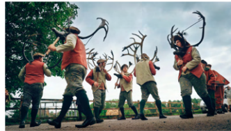
Horn Dance 1 Abbots Bromley Horn Dance, Staffordshire "Abbots Bromley Horn Dancers performing on Horn Dance Day"