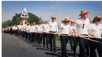
Rushbearing 2 Sowerby Bridge, West Yorkshire "Cart Pullers pulling the Rushcart"