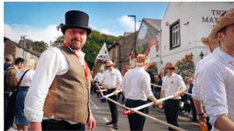
Rushbearing 1 Sowerby Bridge, West Yorkshire "Procession through Warley Village"