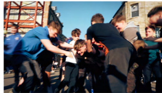
Jethart Hand Ba' 2 Jedburgh, Scottish Borders "The Boys Ba' is played in the streets"