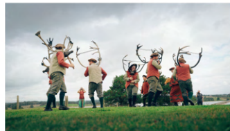
Horn Dance 3 Abbots Bromley Horn Dance, Staffordshire "Abbots Bromley Horn Dancers performing"