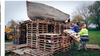
Bonfire 2 Rye Bonfire, East Sussex "A boat is placed on top of the bonfire"