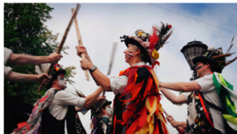
Rushbearing 3 Sowerby Bridge, West Yorkshire "Morris Dancers perform at Rushbearing"