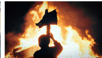
Bonfire 3 Rye Bonfire, East Sussex "Silhouette with boat burning in background"