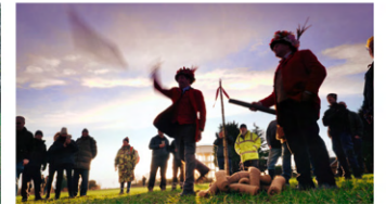
Haxe Hood 2 Haxe Hood, Lincolnshire "Gathering on the top field before the game"