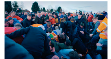
Haxe Hood 3 Haxe Hood, Lincolnshire "The sway collapses"