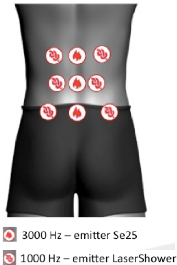
Figure 1 Photobiomodulation therapy irradiation sites.

based on previous studies 18–21 and to cover the largest possible area of the lumbar spine: three central sites on top of the spinous processes (between T11 and T12, L2 and L3, L5 and S1), using the SE25 (3000 Hz of frequency, 3 min of irradiation per site, 24.75 J per site, a totalising 74.25 J irradiated from SE25); in the same direction, but laterally, three sites on the left and three on the right (on the paravertebral muscles), using the LaserShower (1000 Hz of frequency, 3 min of irradiation per site, 24.30 J per site, a total of 145.80 J irradiated from LaserShower). At each treatment session, patients will receive a total dose of 220.05 J. At the end of the 12 treatments sessions, patients will receive a total dose of 2640.60 J. Table 1 shows parameters for SE25 and LaserShower cluster probe. This PBMT application protocol was based on the study of Leal Junior et al. 42