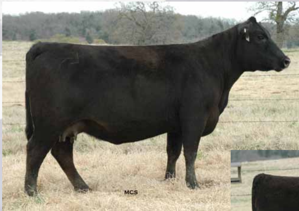
lot 25 - Lesikar Blackbird T213