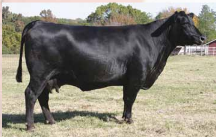
Dam of lot 20