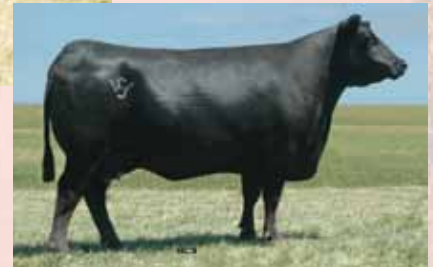
BAAR Primrose 2404-004 Granddam of lot 2