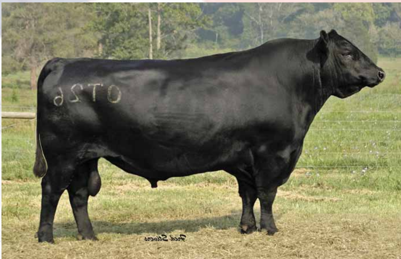
SS Objective T510 0T26 - Sire of lots 36A and 37A

This Objective daughter offers the same look and functional advantages of her dam while blending the carcass and numerical traits of her sire. Ranks in the top 20% for Milk and $W.