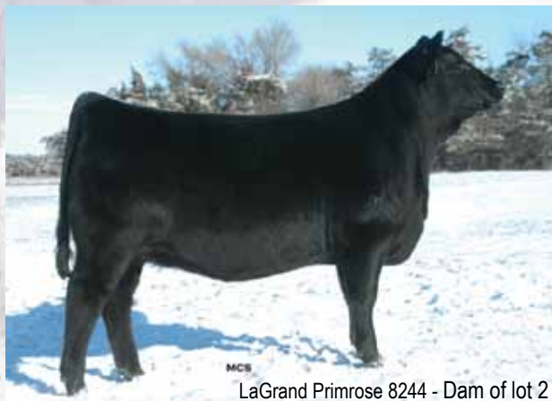
LaGrand Primrose 8244 - Dam of lot 2

The dam of this female, A Plus Blackcap 0037, is a daughter of the legendary GAR Scotch Cap 867, the foundation of the most recognized and valuable carcass genetics family in the Angus breed today. 0037 is a full sister to the $300,000 valued Limestone, LLC and Blue Sky Ranches donor, GAR EXT 2104, the dam of GAR Precision 2536. Another full sister, GAR EXT 2114, is the $120,000 Whitestone/Sandpoint/Harry Meyer/B&B donor that has generated over a million dollars in progeny sale to date. Other full sisters to 0037 include, the $480,000 Coleman Blackcap 0813, EXT 3104, the $150,000 valued donor for Pollard Farms, Express Ranches and Limestone; the $175,000 A Plus Blackcap 0097, the $120,000 Callaways Blackcap 0943, Blackcap 0880; Blackcap 0652, the $23,000 Brasstown Valley headliner; and Blackcap 0651, the $17,500 Morgan Angus foundation Blackcap. Backed by generations of successful breeding, this young female offers genetic excellence and phenotypic value.