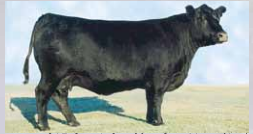
GAR Scotch Cap 867 - Granddam of lot 1