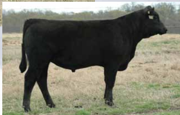
lot 39A - Lesikar Objective W517