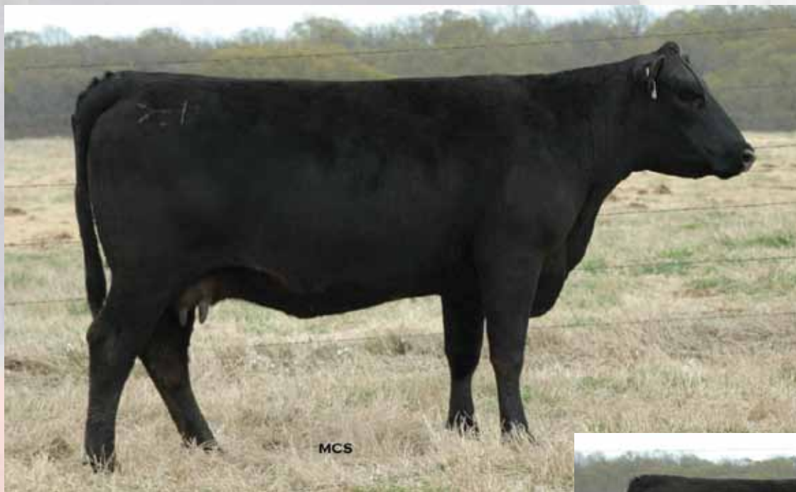
lot 39 - Lesikar Lady T634