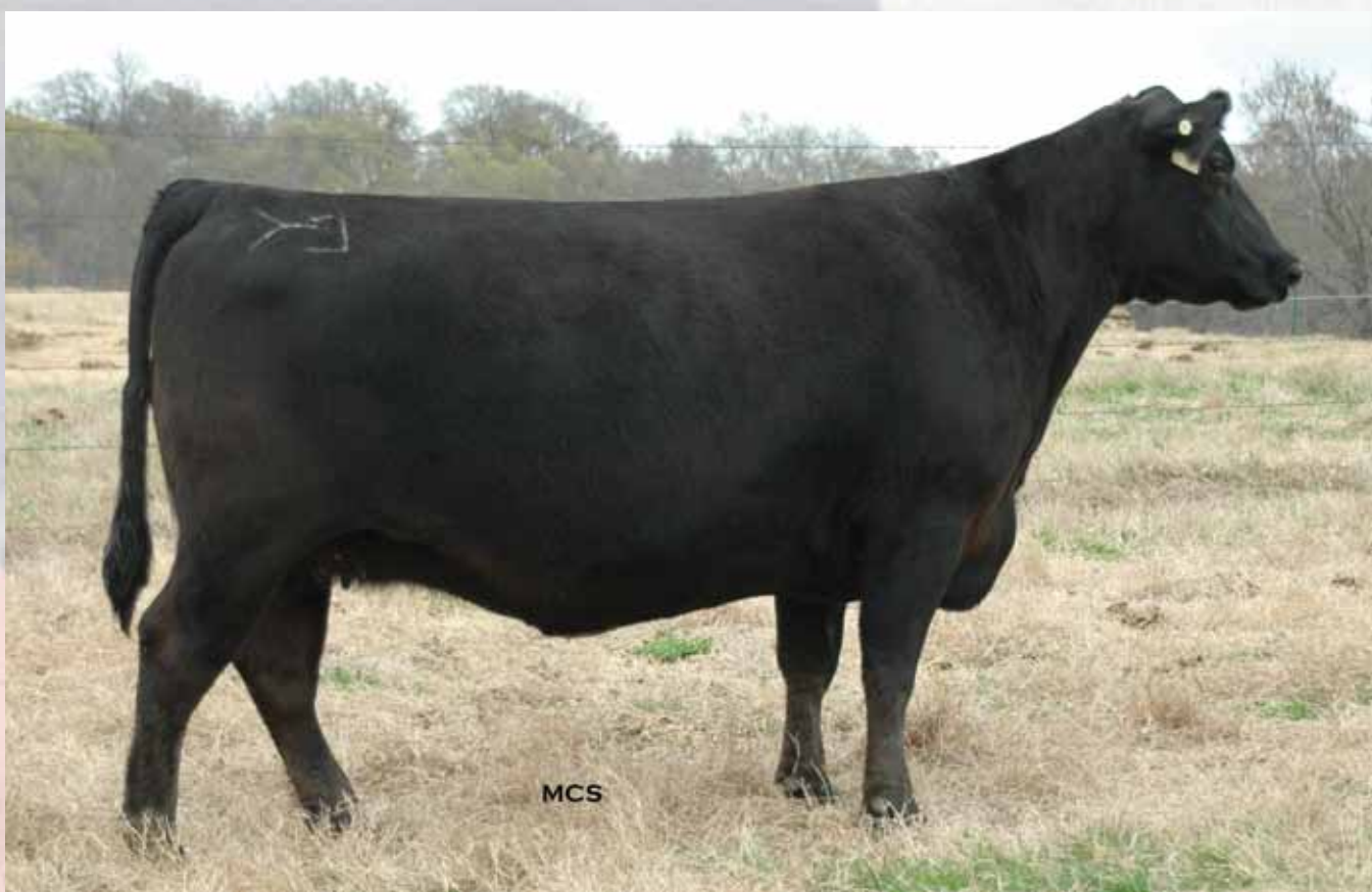
lot 59 - LAR Lucy L18