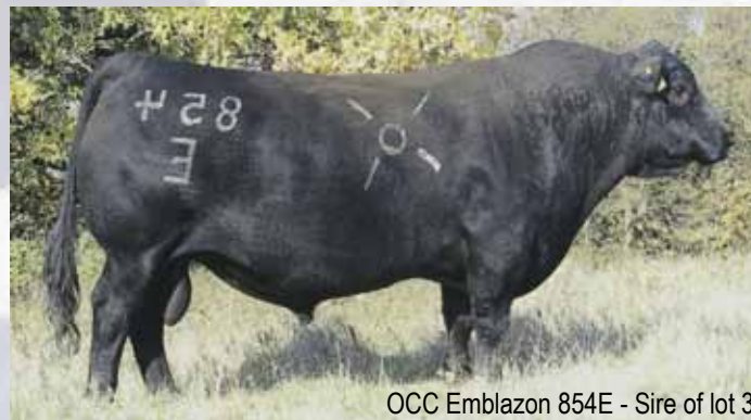
OCC Emblazon 854E - Sire of lot 3

This exciting sale feature is out of the cornerstone donor for Lesikar Ranch, Barbara 087. Combining the proven genetic performance her dam is known for, adding the power and style of Emblazon provides profit generating potential to this young donor prospect. Her super attractive donor dam has a production record of 4 at 101 for weaning and 3 at 104 for yearling with 21 at 104 for RE.