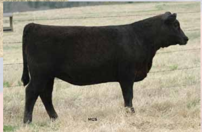
lot 25A - Lesikar Pride W496

This All Around daughter is a well balanced high volume female that couples proven performance from many of the breeds leading progeny sires.