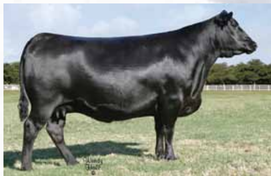
GAR New Design 1440 - Granddam of lot 4