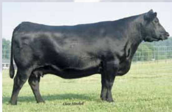
GAR Precision 614