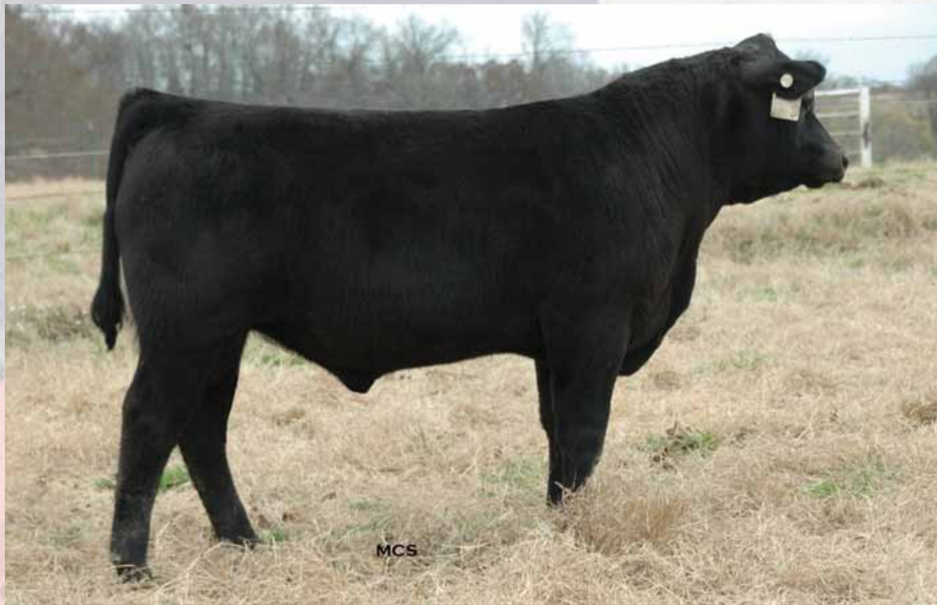
lot 43A - Lesikar In Focus W886