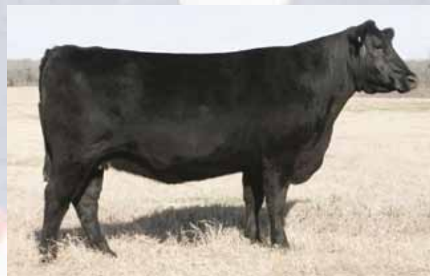
Dam of lot 21

The J&J Racquel 534 donor has consistently produced high quality offspring time and time again. 534 offspring have been featured in previous Lesikar sales and are among favorites every year. This All Around daughter couples the look and style of her donor dam with power and stoutness, while staying true to Racquel genetics as W844 offers a balanced set of EPD traits. Ranks in the top 15% for $B, and top 20% for Milk and $G.