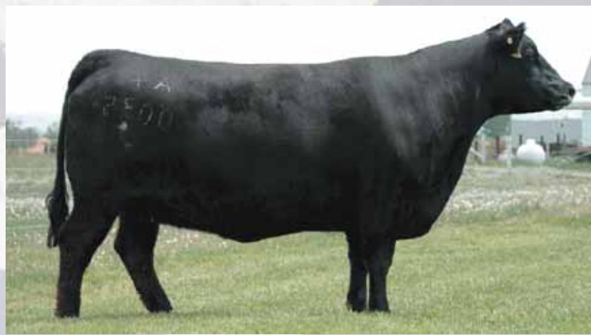
Flush sister to dam of lot 1