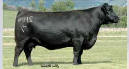
Full sister to dam of lot 1