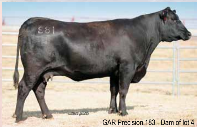
GAR Precision 183 - Dam of lot 4

This exciting sale feature is out of the cornerstone donor for Lesikar Ranch, Barbara 087. Combining the proven genetic performance her dam is known for, adding the power and style of Emblazon provides profit generating potential to this young donor prospect. Her super attractive donor dam has a production record of 4 at 101 for weaning and 3 at 104 for yearling with 21 at 104 for RE.