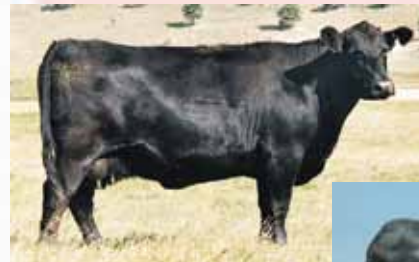
N Bar Primrose 2424 Great Granddam of lot 2