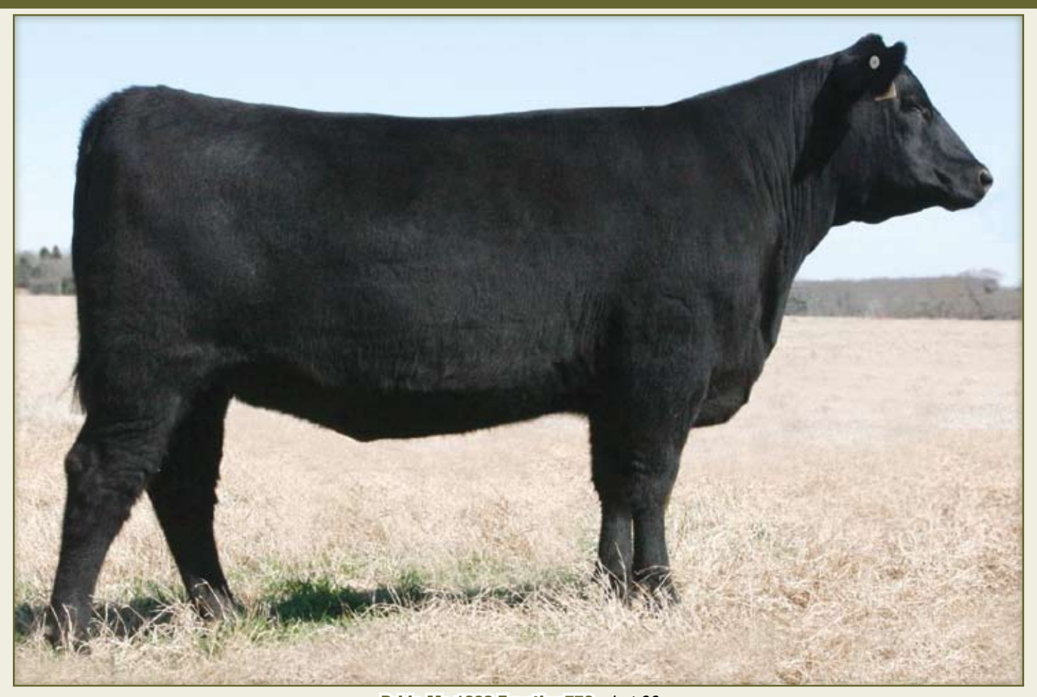
Pride Ms 1680 Frontier 776 - Lot 28