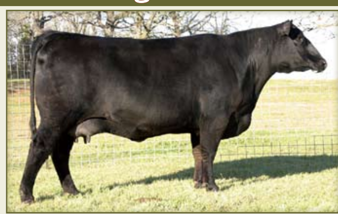
R Bar M Forever Lady 203 - Donor dam of Lots 7 and 7A.