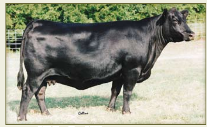
GAR New Trend 838 - Grandam of Lot 14.