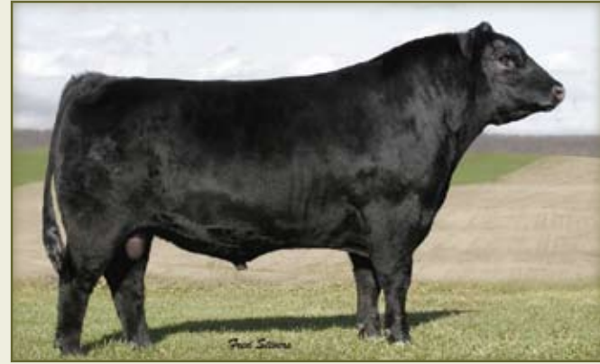
B/R New Frontier 095 - Sire of several lots.

+8 +2.3 +40 +81 +17 +6.38 Another awesome daughter of New Frontier out of a moderate framed, heavy milking dam. This female earned individual ratios of 111 for weaning, 126 for yearling, 111 for IMF and 137 for RE. She has started an impressive production record with two head turned in to AHIR that ratio 95 for birth, 100 for yearling and 103 for IMF. Erica P274 sells with Lot 49A, a heifer calf (U406) born 11/22/08 that weighed 80 lbs. at birth and is sired by BC Marathon. She was bred back on 2/2/09 to the number three sire in the breed for $Beef from ABS Global, Objective.