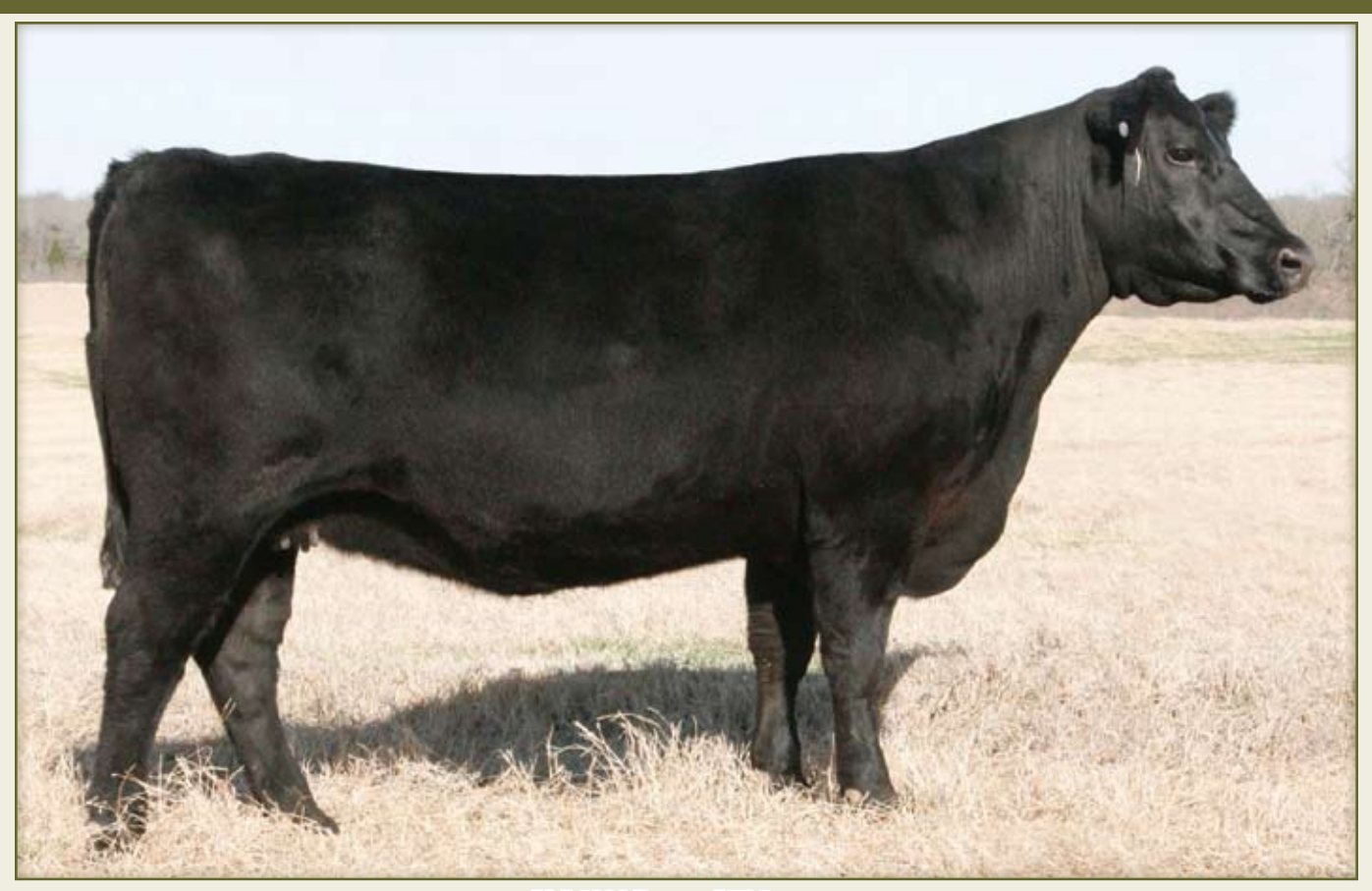
J&J 1680 Racquel 534 - Lot 5