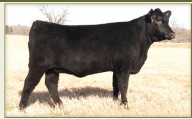
Lesikar Entense U713 - Lot 21A

This heifer comes straight from the heart of the Lesikar Angus Ranch ET program. She is sired by the marbling and phenotype sire, Midland, and offers a balanced set of EPDs and is the type of female that you can build from. Her super attractive donor dam has a production record of 4 at 101 for weaning and 3 at 104 for yearling with 21 at 104 for RE. Barbara U720 sells bred to the big spread sire with an autrops pedigrap APS (lobal Connects All Actuard outcross pedigree from ABS Global, Connealy All Around.