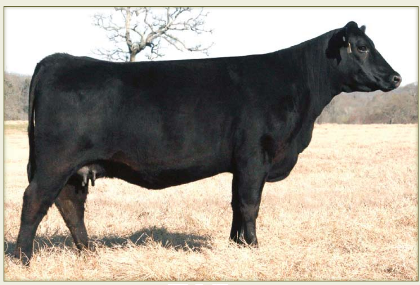
DCF Errolline 6600 - Lot 41

A beautifully patterned heifer sired by the former Denver champion, Crossover. She is out of a dam that has an amazing ten Pathfinders in her three-generation pedigree and earned individual ratios of 100 for weaning, 101 for yearling and 104 for IMF. She will sell weaned on sale day. Birth weight 62 lbs.