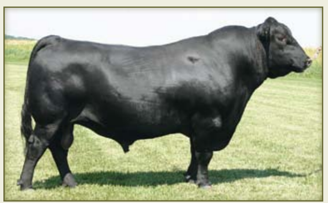
Bon View New Design 878 - Pathfinder Sire of Lot 66.

+9 | +1.2 | +39 | +74 | +14 | +11.09 | If you want to see the producing power of this cow, just look at her daughter, who is Lot 23 in this event. This female was bred for calving-ease, maternal strength, growth and efficiency; she ranks in the top half of the breed for $Energy. Her dam, Evergreen L30, has four head turned in to AHIR that ratio 98 for birth, 102 for weaning and 104 for RE. Evergreen N159 sells with Lot 64A, a 12/12/08 bull calf that weighed 72 lbs. at birth and is sired by the popular standout from ABS Global, Dr. J Analyst. She will be bred back to BC Marathon.