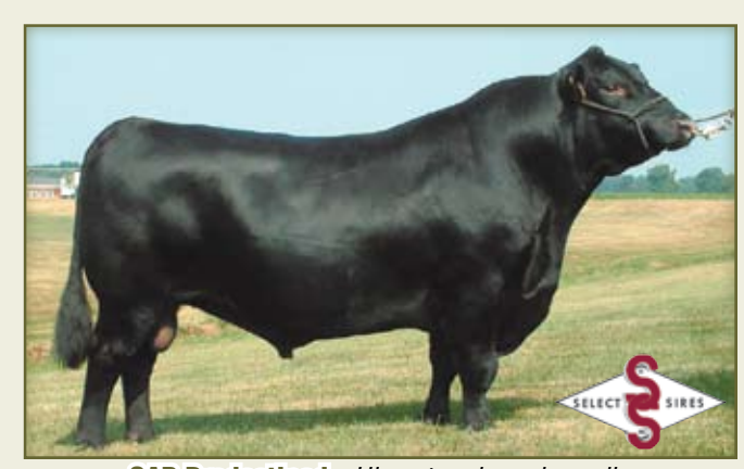
GAR Predestined - His get and service sell.

t6 +2.9 +40 l+75 +24 +1.89 Offering a heifer that combines the power and carcass potential of Predestined with maternal strength from her dam. The predictability of this female is off the charts with eight Pathfinders in her three-generation pedigree. Her dam has an impressive production record of 6 at 99 for birth, 7 at 101 for weaning, 5 at 101 for yearling and 3 at 108 for IMF. Evergreen T703 ranks in the top 10% of the breed for four EPDs and $Values, including Marb and $Beef. She will sell bred to the curve bender from ABS Global, Objective. The combination of Predestined and Objective will give you breed-leading numbers with unmatched carcass potential.