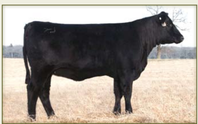
Lesikar Miss T681 - Lot 30

$Grid and $Quality Grade. She is due to calve 8/20/09 to the number three bull in the breed for $Beef, Objective.