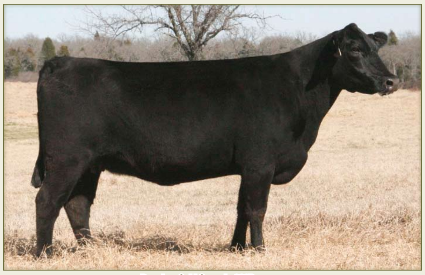
Premium Gold Queenie 302R – Lot 2