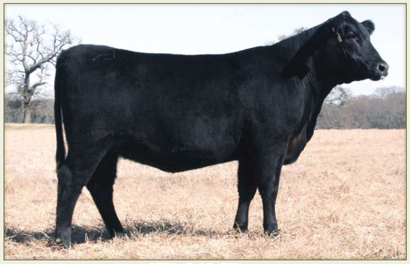
DCF Future Emulation 7510 - Lot 6