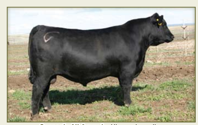
Connealy All Around - His service sells.

You can really see the breeding philosophy of Lesikar Angus when you study these heifers. Start with a cow that is bred for feed efficiency and maternal strength then add a bull to improve growth and carcass potential. The result is a total package individual like Evergreen T304. She earned individual ratios of 92 for birth, 102 for weaning, 101 for yearling and 102 for IMF. This heifer sells bred to the Select Sires standout, ALC Big Eye.