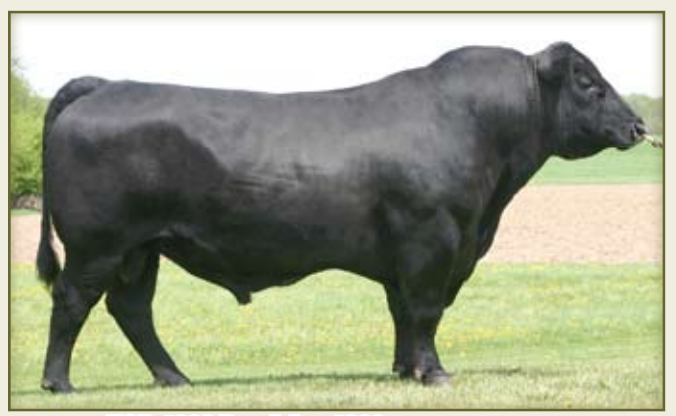
E&B 1680 Precision 1023 - Sire of Lot 71.

A full brother to Lot 69, which means that his dam is the beautiful Lesikar donor, Burgess 750L, who is an own daughter of the Classic Oaks Ranch donor, Burgess 9523, that has a production record of 2 at 95 for birth, 109 for weaning and 104 for yearling with 9 at 101 for IMF and 104 for RE. This awesome calf earned an individual RE ratio of 101 and ranks in the top 10% of the breed for five different traits including top 1% for RE and top 2% for $Beef. It is hard to see much difference in these two great brothers!