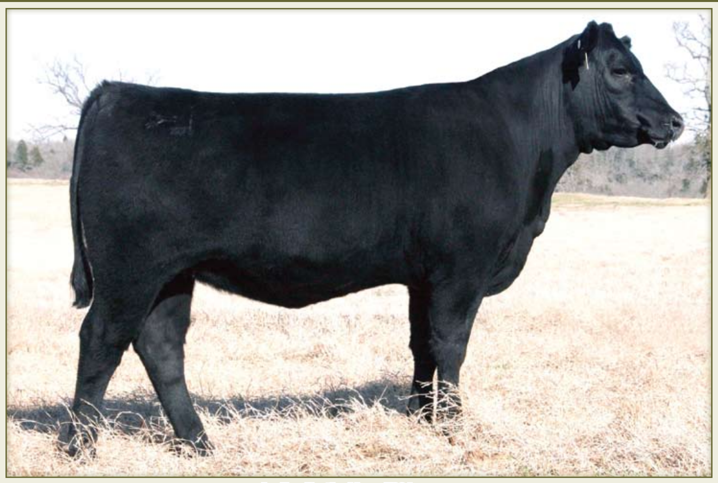
Lesikar Heatherbloom T224 - Lot 31