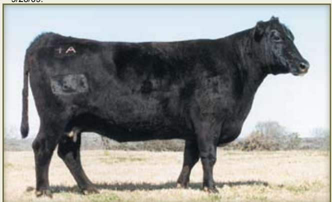
Thomas Lucy 9083 - Dam of Lot 1.

CED BEPD WEPD YEPD MILK $EN +6 +2.8 +41 +81 +29 -4.26 We lead off this year's event with a breathtaking young donor sired by the high end product sire, Retail Product, who has built a reputation for producing high volume females with beautiful udders on a moderate frame. The dam of this female, Lucy 9083, was the $20,000 selection of Limestone LLC & Sandpoint in the historic A Plus dispersal and is well-known for producing cattle that offer a huge ribeye, which is evident with Lucy 313R ranking in the top 1% of the breed for that trait. She also ranks in the top 1% for $Beef and 5% for $Grid. This valuable donor scanned well, earning individual ultrasound ratios of 110 for IMF and 115 for RE. She has one natural calf turned in to AHIR that earned ratios of 100 for birth and 102 for weaning with four head scanned by ultrasound that ratio 113 for IMF. 102 for weaning with four head scanned by ultrasound that ratio 113 for IMF. Lucy 313R sells bred to the high growth sire from Genex/CRI, Traveler 004, due