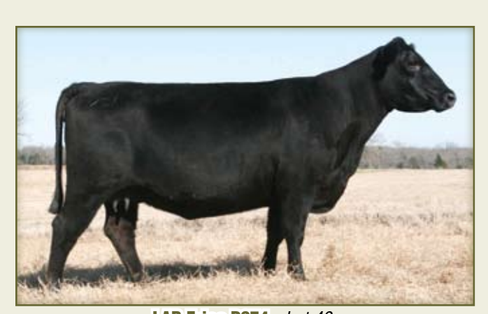
LAR Erica P274 - Lot 49

New Frontier 095 has done a great job here at Lesikar Angus adding style and marbling ability. This female is out of a dam that was linebred to Paramont Ambush 2172 for predictability. Lass R374 ranks in the top 5% of the breed for $Grid, top 10% for Marb and $Quality Grade as well as the top 15% for $Beef. She sells with Lot 48A, a heifer calf (U387) born 10/23/08 that weighed 54 lbs. at birth and is sired by the Lesikar herd sire, Direction T47. This productive female is safe in calf, due 9/24/09 to the spread sire from ABS Global, In Focus. Please note that this female is due to calve one month earlier this year than last year!