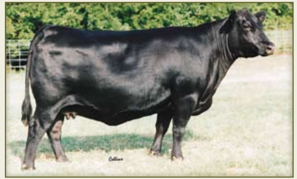
GAR New Trend 838 - Great-grandam of Lot 8.

S +6 +3.0 +58 +111 +25 +3.00 D 1+6 +3.0 +50 +84 +20 +2.46 Heifer Pregnancy – 928 x 203 in a commercial recip. Offering two heifer pregnancies sired by the growth and power sire from ABS Global, Destination 727-928, out of a maternal sister to the growth and power sire from CSC 1750 COM This pretire sifer to be growth and power sire from Genex/CRI, Traveler 004. This mating offers unbelievable growth and carcass potential. The resulting heifers will be built in with an EPD profile of BW +3, WW +54, YW +98, Marb +.59, RE +.38, $Wean +32 and +60 for $Beef. The productive dam of this pregnancy has one calf turned in to AHIR that posts ratios of 113 for weaning, 101 for yearling and 112 for IMF. These exciting heifers are due 8/23/09.