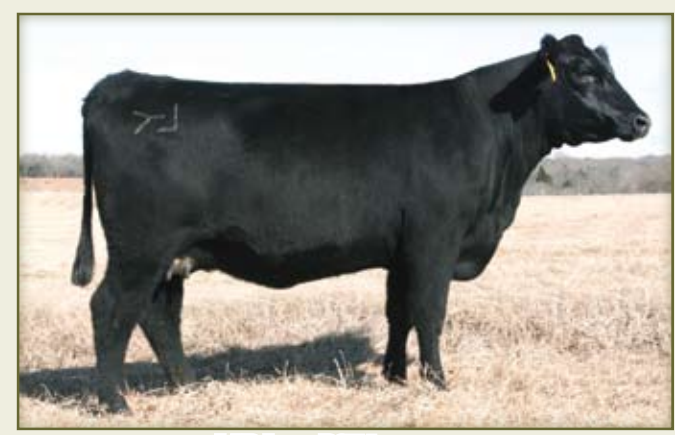
LAR Lass R374 - Lot 48

Leading off the three-in-one heifer pairs we have this super stylish daughter of New Frontier 095, who ranks among the top 150 sires of the breed for $Beef. This female has eight Pathfinders, including all seven sires, in her three-generation pedigree. She earned an individual RE ratio of 101. Her dam has three head turned in to AHIR that ratio 103 for IMF. Anne P264 sells with Lot 47A, a heifer calf (U386) that was born 10/22/08 and weighed 80 lbs. sired by the ribeye and phenotype sire Marathon. She was bred back on 1/18/09 to the spread sire from ABS Global, in Focus.