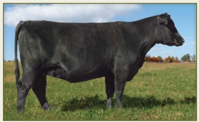
Twin Eagles Princess 775L - Donor dam of Lots 12 and 12A.

p +8 +3.4 +48 +89 +28 -5.76 A daughter of the marbling and phenotype sire Midland, out of a donor cow that comes from a family that has proven to produce big ribeyes in their progeny. The dam of this heifer has two natural calves turned in to AHIR that ratio 95 for birth, 109 for weaning and 104 for yearling with nine head scanned by ultrasound that ratio 101 for IMF and 104 for RE. The grandam of this heifer is a featured donor for Classic Oaks ranch. A great opportunity to obtain a female that is ahead of the curve in terms of red meat production.