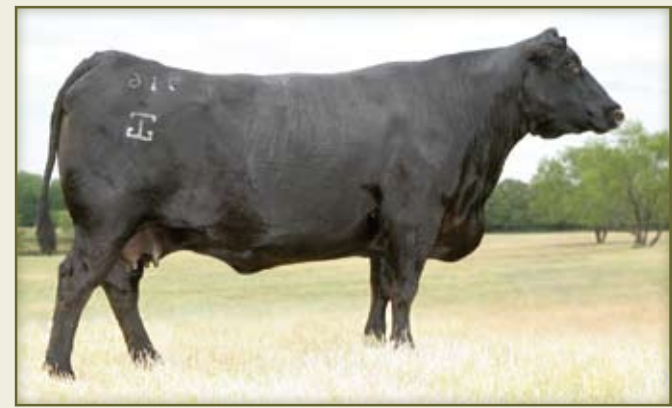
GAR Ext 916 - Pathfinder Dam of Lot 2.

+9 +.6 +41 +78 +11 +13.46 Offering a special opportunity to purchase a daughter of the Roden Angus donor, GAR EXT 916, the dam of the long-time feature at ABS Global, Alliance I87. The GAR EXT 916, the dam of the long-time feature at ABS Global, Alliance I87. The beauty of this young donor is no surprise with both of her parents being known for producing extremely eye-appealing, valuable cattle. Queenie 302R earned individual ultrasound ratios of 116 for IMF and 109 for RE. Her Pathfinder Dam has an impressive production record of 4 at 99 for birth, 5 at 106 for weaning and 4 at 108 for yearling with 45 head scanned by ultrasound that ratio 104 for IMF and 102 for RE. This enticing female ranks in the top 10% of the population for Marb, RE, $Grid, $Quality Grade and $Beef. She was bred on 2/3/09 to the exciting young spread sire with an outcross pedigree from ABS Global, Connealy All Around.