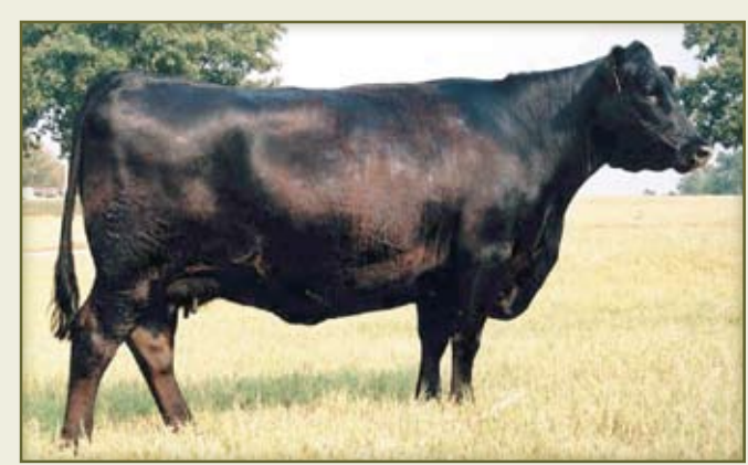
Twin Eagles Princess 8320 - Grandam of Lot 58.

CED BEPD WEPD YEPD MILK SEN I+8 +2.6 +49 +92 +24 -3.21 Princess 109T is a moderate framed female with loads of capacity. Her grandam is a full sister to the maternal sire from ABS Global, Dalebanks Extender. This female earned individual ratios of 115 for weaning and 100 for yearling. Her donor dam has a production record of 2 at 93 for birth, 102 for weaning and 100 for yearling with 18 at 103 for RE. She sells with Lot 58A, a 10/26/08 bull calf (U389) that weighed 66 lbs. at birth and is sired by the Select Sires standout, New Design 5050. This awesome female was bred back on 1/21/09 to the young, outcross sire from ABS Global, Connealy All Around.