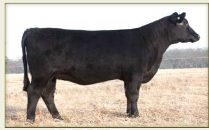
Lesikar Barbara T232 - Lot 26