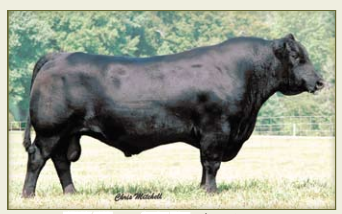
KMK Alliance 6595 187 - Sire of Lot 52.

MA Pride 163 Snam 521 CED BEPD WEPD YEPD MILK SEN +3 +3.2 +40 +75 +28 -1.66 A daughter of one of the original carcass sires from ABS Global, New Design 036, out of a dam that was bred for milk, milk and more milk, which is probably why this female ranks in the top 10% of the breed for that trait. She has three calves turned in to AHIR that ratio 105 for weaning and 102 for both yearling and RE. Pride N154 sells with Lot 51A, a heifer calf (U412) born 11/26/08 that weighed 80 lbs. at birth and is sired by Retail Product. She was bred back on 2/2/09 to the ABS Global feature. Analyst feature, Analyst.