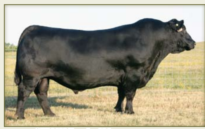
SAV 8180 Traveler 004 - His service sells.

b +2 +4.1 +34 +60 +23 +7. Be sure to check out this Grid Maker daughter, she is absolutely flawless in her design with power to spare. Her dam has one calf turned in to AHIR that posts ratios of 92 for birth, 104 for weaning and 100 for IMF. She will sell weaned on sale day. Birth weight 90 lbs.