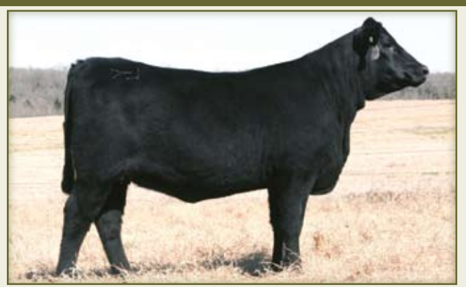
Lesikar Ever Entense T701 - Lot 21