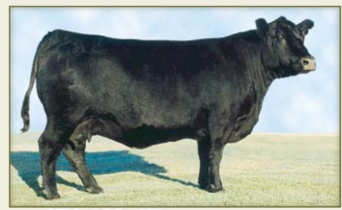
GAR Scotch Cap 867 - Great-grandam of Lot 4.

CED BEPD WEPD YEPD MILK $EN I+8 I+4.1 I+49 I+92 I+28 -7.05 Here we have a bull calf with loads of potential. He offers the carcass power of his sire, Predestined, with the producing power of his productive dam who comes from a long line of famous, high valued females. Blackbird 506 ranks in the top 1% of the population for RE and $Beef and the top 15% for Marb. She is a maternal sister to such famous individuals as the $68,000 Blackbird 2211 at Rutherford Ranch. the $25,000 Blackbird 2222 at Express Ranches and the $20,000 Blackbird 0434 at Boyer Angus.