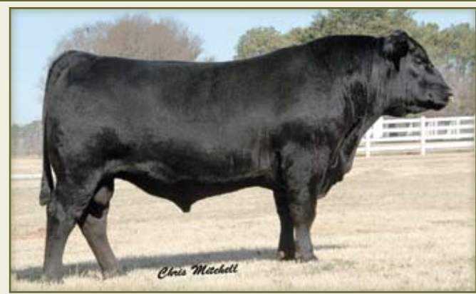
Dr J Analyst M250 - His service sells.

A beautiful daughter of the cow maker, Alliance 6595. This female earned individual ratios of 96 for birth, 102 for weaning, 102 for yearling and 111 for RE. She has one calf turned in to AHIR that posts ratios of 103 for yearling and 113 for IMF. Erica P280 sells with Lot 55A, a 12/19/08 heifer calf (U429) that weighed 80 lbs. at birth and is sired by the dominant Predestined. She was bred back to Predestined on 2/4/109