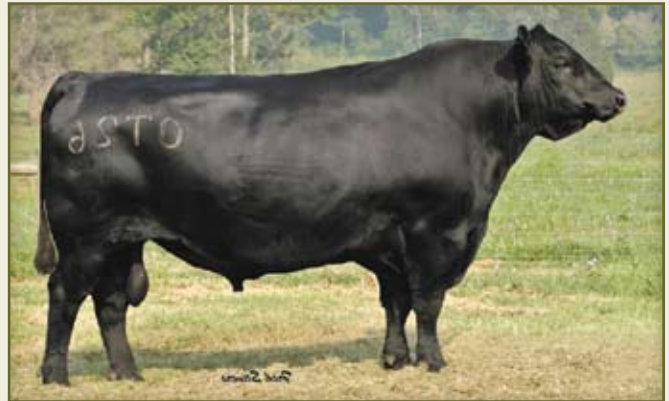
SS Objective T510 OT26 - His get and service sell.