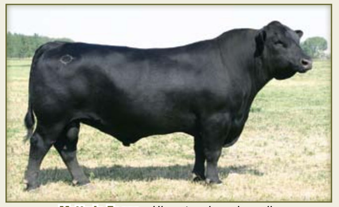
Mytty In Focus - His get and service sell.

Sheef and top 15% for eight other traits. The grandam of this female is the Lesikar donor Barbara 087, who has a production record of 4 at 101 for weaning and 3 at 104 for yearling with 21 at 104 for RE. This awesome female sells due to calve 9/24/09 to the big spread sire from ABS Global, In Focus.