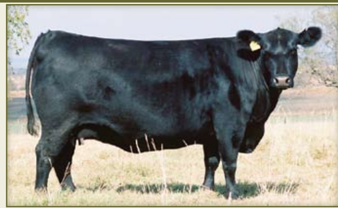
959M - The $11,500 maternal sister to Lot 63.

Another female that stems from the great Lesikar donor, Barbara 087, who has 21 head turned in to AHIR that ratio 104 for RE. She earned individual ratios of 114 for weaning, 117 for yearling and 119 for RE and ranks in the top 4% of the breed for six traits including WW, YW, CW, RE, $Feed and $Beef. Barbara S587 sells with Lot 67A, a 1/5/09 bull calf (W438) that weighed 62 lbs. at birth and is sired by the ribeye and phenotype sire from Limestone LLC, Marathon. She will be bred back to the Select Sires standout, ALC Big Eye.