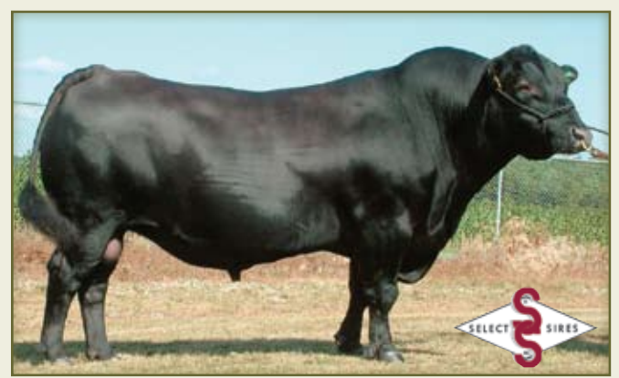
GAR Retail Product - His get and service sell.

CED BEPD WEPD YEPD MILK $EN +9 +.7 +58 +102 +23 -5.50 This female offers one of the largest spreads in the sale ranging from .7 for Birth to 102 for Yearling. Erica S531 earned individual ratios of 92 for birth, 108 for weaning and 102 for IMF. She ranks in the top 1% of the breed for WW and YW and top 4% for $Wean, $Feed and $Beef. She sells bred to calve 9/3/09 to the standout from Select Sires, Predestined.