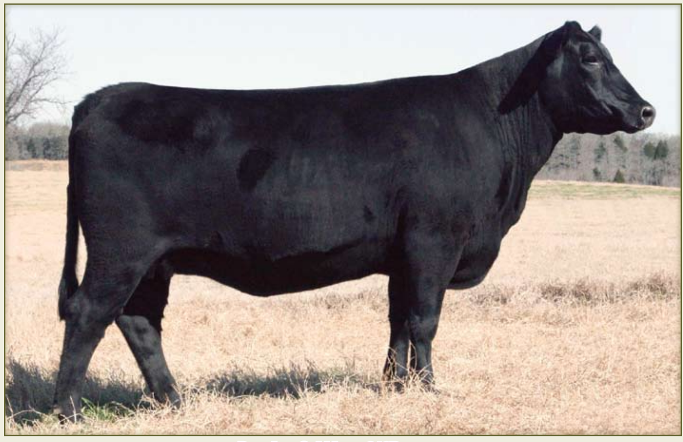
Premium Gold Lucy 313R – Lot 1