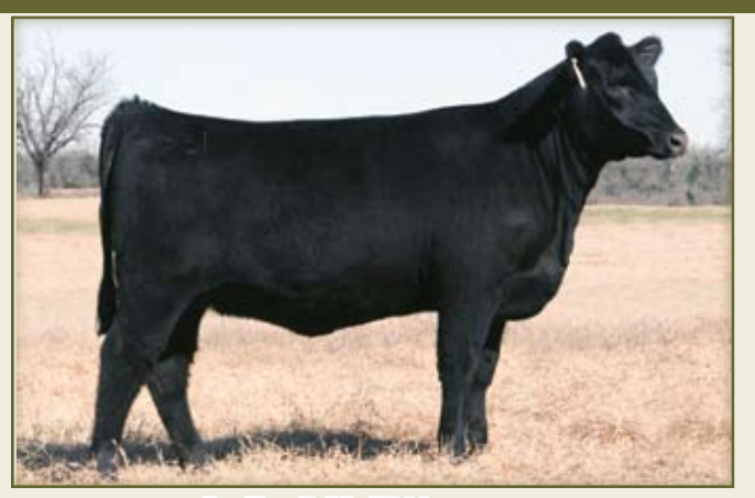
Lesikar Pride T269 - Lot 15