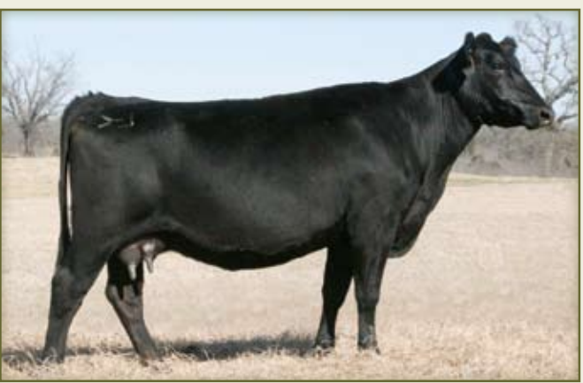
LAR Blackbird P209 - Lot 60

+4 +2.7 +42 +77 +19 +5.83 Another daughter of the cornerstone donor for Lesikar Angus, Barbara 087, this one sired by the maternal sire Traveler 8180. This female has two calves turned in to AHIR that ratio 104 for both weaning and yearling. Her dam has 21 at 104 for RE. Barbara P248 sells with Lot 59A, an 11/8/08 bull calf (U394) that weighed 80 lbs. at birth and is sired by ALC Big Eye. She was bred back on 2/6/09 to BC