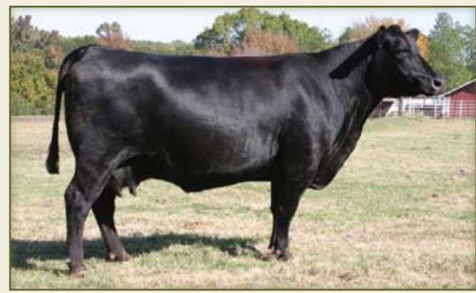
Twin Eagles Burgess 750L - Donor dam of Lots 11, 69, 69A and 70.

We lead off the bred heifers with a heifer that is perfect for the times. She's moderate in her frame size with loads of volume and eye appeal and offers the feed efficiency that everyone is looking for. The Retail Product daughters have proven to be just that kind with beautiful udders. This awesome individual is a granddaughter of the famous GAR New Trend 838. Her dam, Erica 668K, earned an individual RE ratio of 102 and has two calves turned in to AHIR that ratio 120 for weaning and 107 for yearling. This future donor will sell bred to the curve bender from ABS Global, Objective.