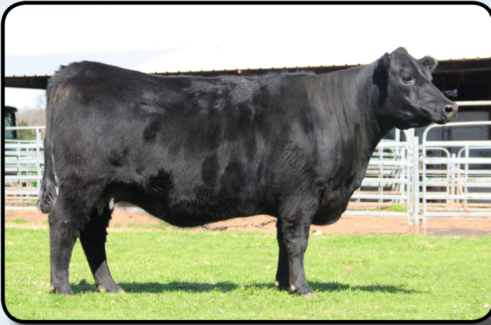
Lesikar Erica B469 • Sells as Lot 60

She is safe in calf to V A R Reserve 1111. Due Date: September 1, 2018