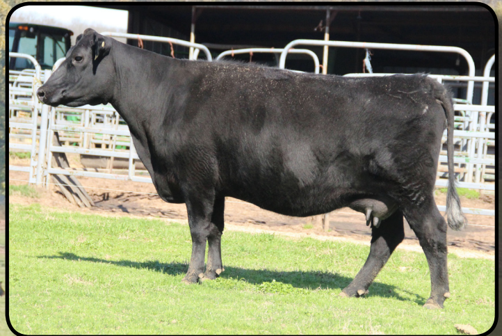
Lesikar Blackcap B534 · Sells as Lot 34