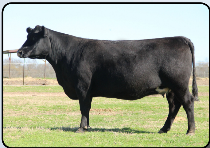
Lesikar Lucy Z991 • Sells as Lot 12

She is safe in calf to Lesikar Rebound X931. Due Date: September 19, 2018