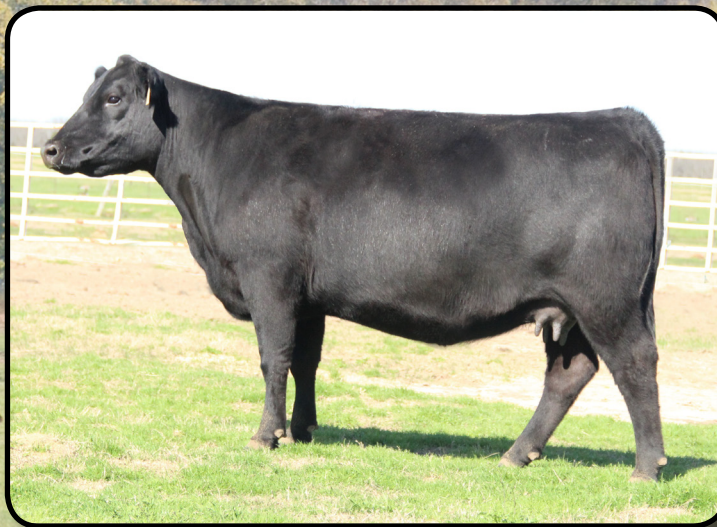
Lesikar Primrose A492 • Sells as Lot 9