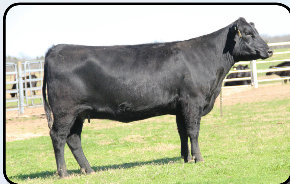
Lesikar Primrose B591 • Sells as Lot 8