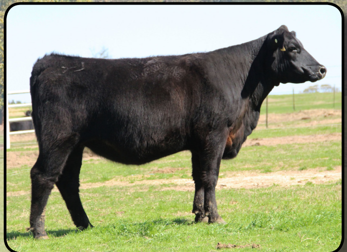
Lesikar Lass C660 • Sells as Lot 69

Bred to Lesikar Rebound X931 on January 8, 2018.