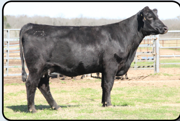
Lesikar Corene C630C · Sells as Lot 33