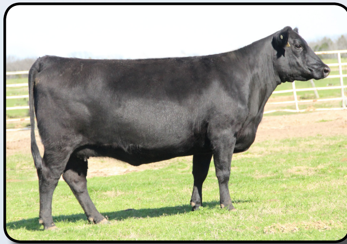
Lesikar Wix A209 • Sells as Lot 24

Bred to Lesikar Rebound X931 on March 4, 2018.