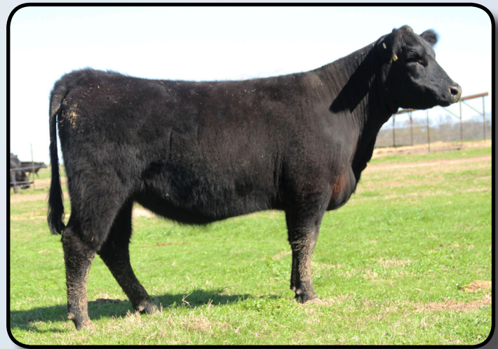
Lesikar Blackcap D719 • Sells as Lot 76

She is safe in calf to V A R Reserve 1111. Due Date: September 16, 2018