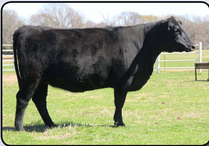
Lesikar Burgess C664 • Sells as Lot 70

She is safe in calf to S A V Bismarck 5682. Due Date: September 27, 2018