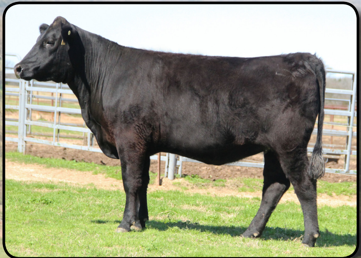
Lesikar Heatherbloom C670 • Sells as Lot 72

She is safe in calf to Lesikar Impact W601. Due Date: August 25, 2018