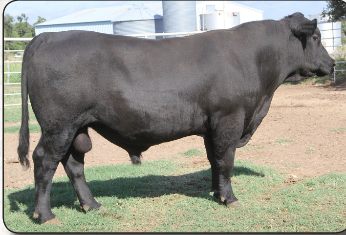
Lot 11 - Lesikar Rebound E373