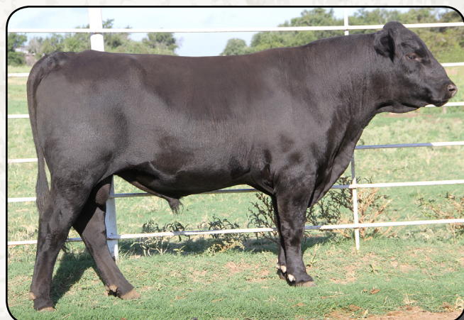
Lot 3 - Lesikar Consensus E953