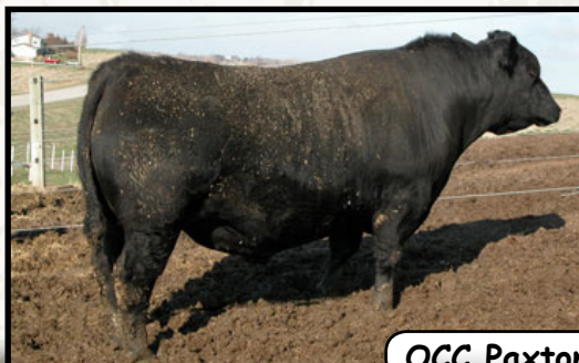
OCC Paxton 730P