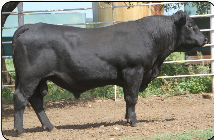
Lot 1 - Lesikar Consensus E112