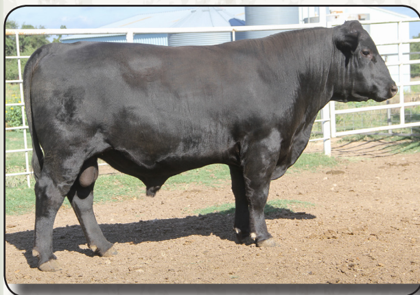
Lot 37 - Lesikar Eureka E950