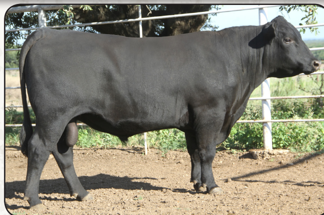
Lot 14 - Lesikar Rebound E929