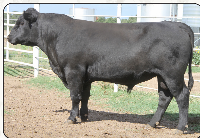
Lot 2 - Lesikar Consensus E911