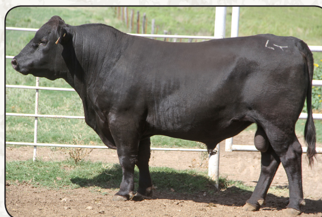
Lot 36 - Lesikar Broadside E935