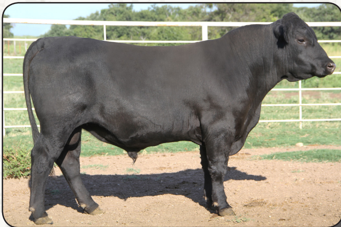
Lot 41 - Lesikar Eureka E992