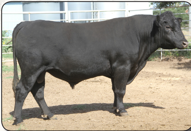
Lot 5 - Lesikar Absolute E368