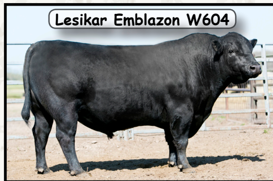
Lesikar Emblazon W604