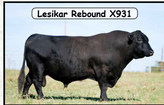
Lesikar Rebound X931