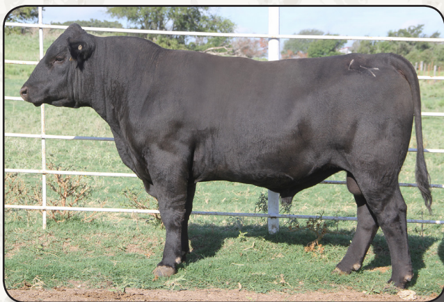
Lot 9 - Lesikar Final Answer E927