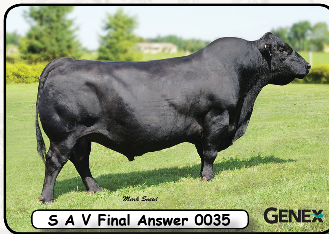
S A V Final Answer 0035