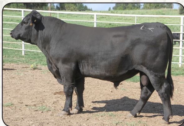
Lot 15 - Lesikar Rebound E934