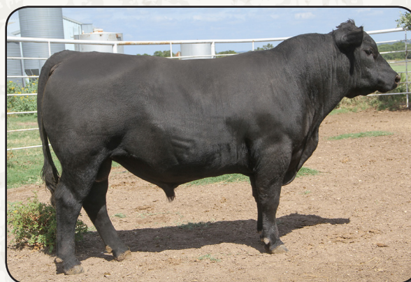
Lot 21 - Lesikar Impact E386