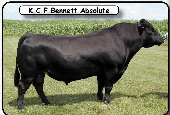
K C F Bennett Absolute