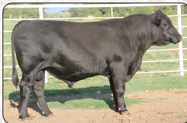
Lot 29 - Lesikar Big Time E400