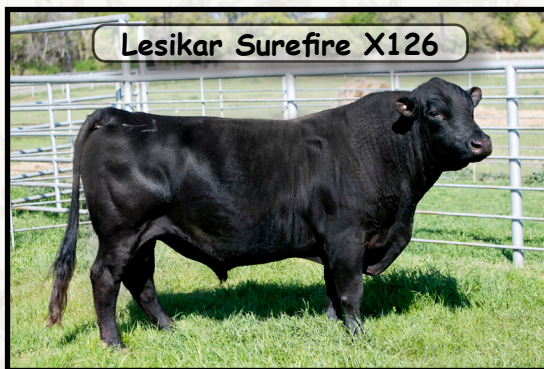
Lesikar Surefire X126