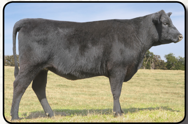
Lesikar Burgess E888 • Sells as Lot 43

Another heir to those maternal traits by Eureka, she ranks in the top 15% for $EN.