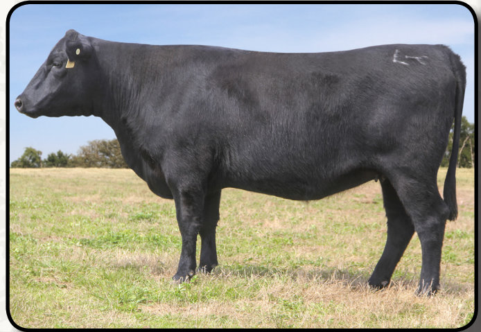
Lesikar Blackcap D750 · Sells as Lot 4