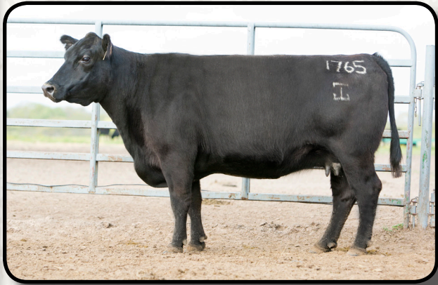
GAR Objective 1765