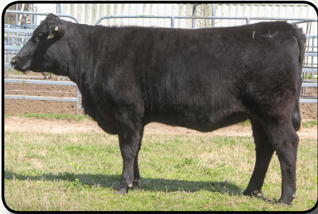
Lesikar Everelda Entense E930 Sells as Lot 49