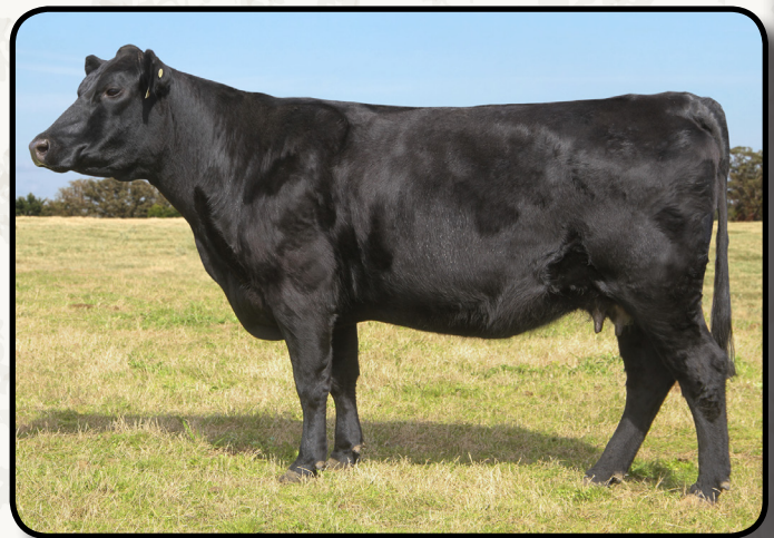
Lesikar Lucy B371 · Sells as Lot 11