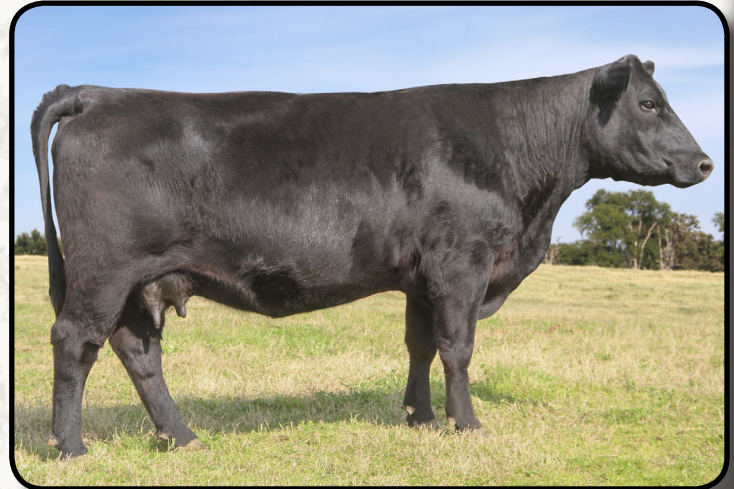
Lesikar Erica B428 • Sells as Lot 21