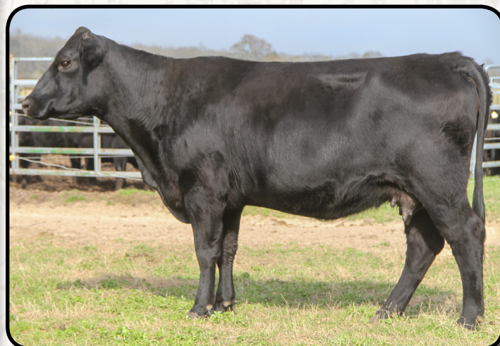
Lesikar Ectessa B386 • Sells as Lot 19

An Impact daughter who is in the top 5% for $EN speaking volumes about this cow's potential for savings in the pasture.