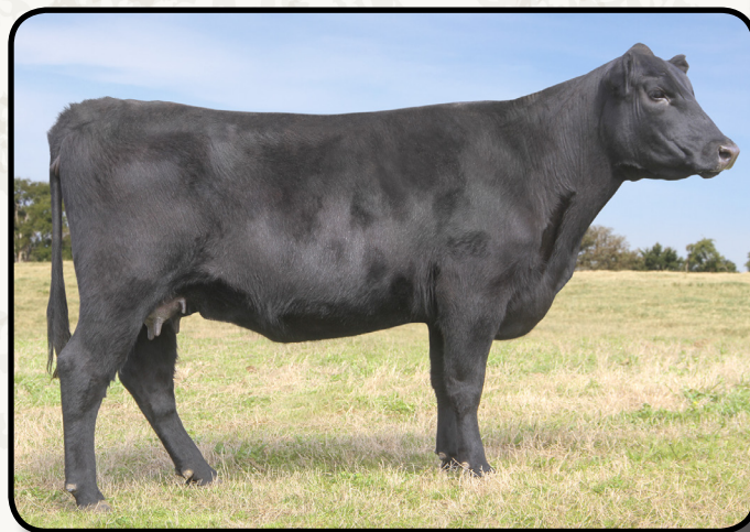
Lesikar Mama C529 · Sells as Lot 15