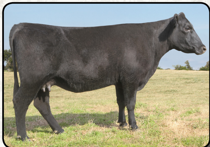
Lesikar Blackcap D676 · Sells as Lot 3A