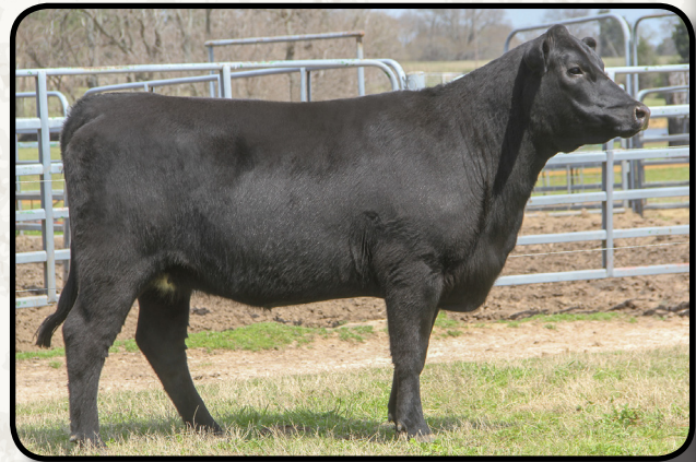
Lesikar Lucy E839 • Sells as Lot 39

O C C Rancher is a secret weapon that adds a little bit everywhere to the animal he blends with. She sports a ratio of 120 @ weaning and a 117 @ yearling. WOW!!! Growth, one word says it all. What good is growth without efficiency? She ranks in the top 40% for $EN.