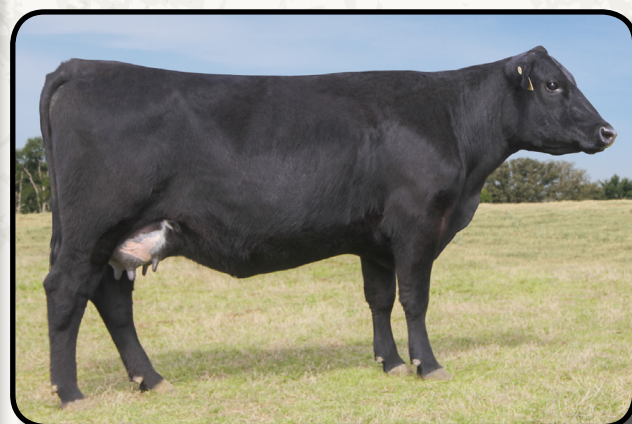
Lesikar Lass B437 · Sells as Lot 27

This Broadside daughter had a weaning ratio @ 106. What an amazing female with a $EN value in the top 15%.