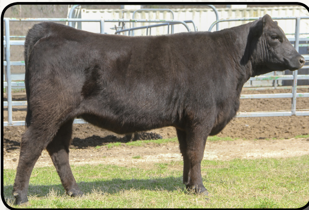
Lesikar Ester E906 · Sells as Lot 51

This Surefire daughter held a 106 ratio @ birth and weaning, and a 105 @ yearling. She managed to make it into the top 25% for $EN.