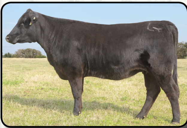
Lesikar Burgess E878 • Sells as Lot 42