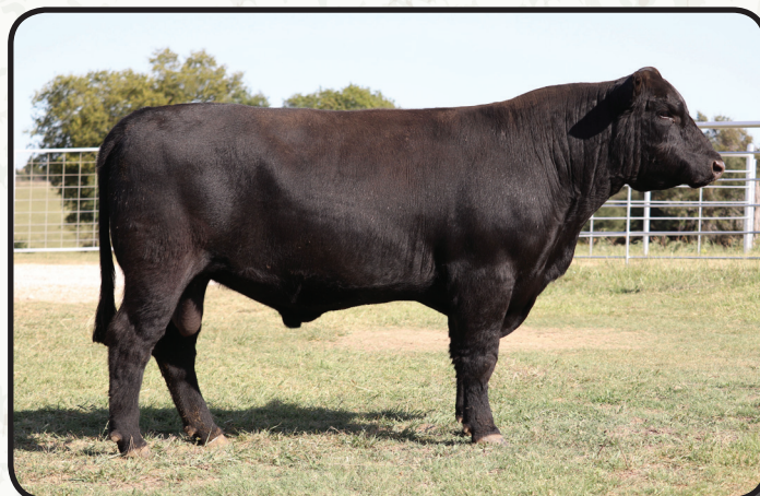
Lot 19 - Lesikar Effective F232