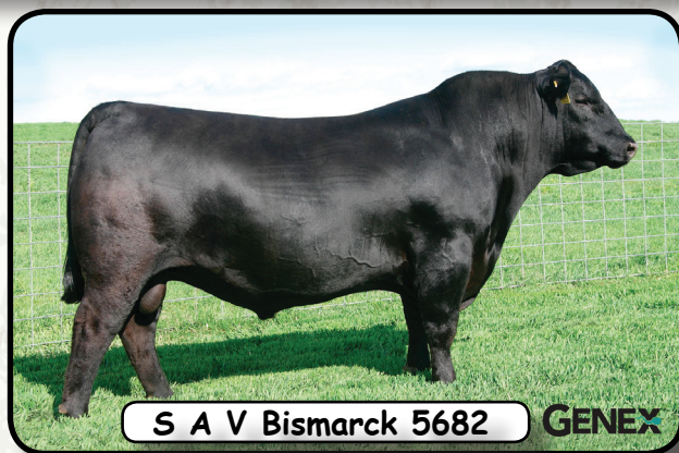
S A V Bismarck 5682