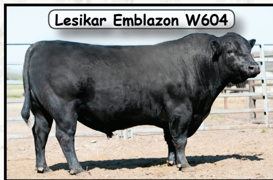
Lesikar Emlazon W604