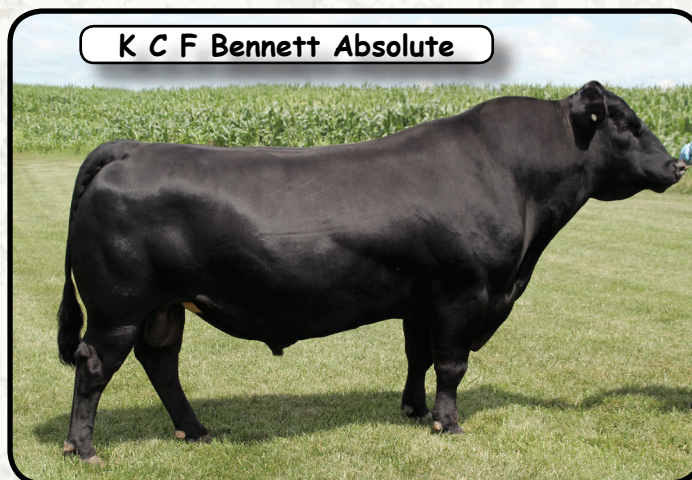
K C F Bennett Absolute