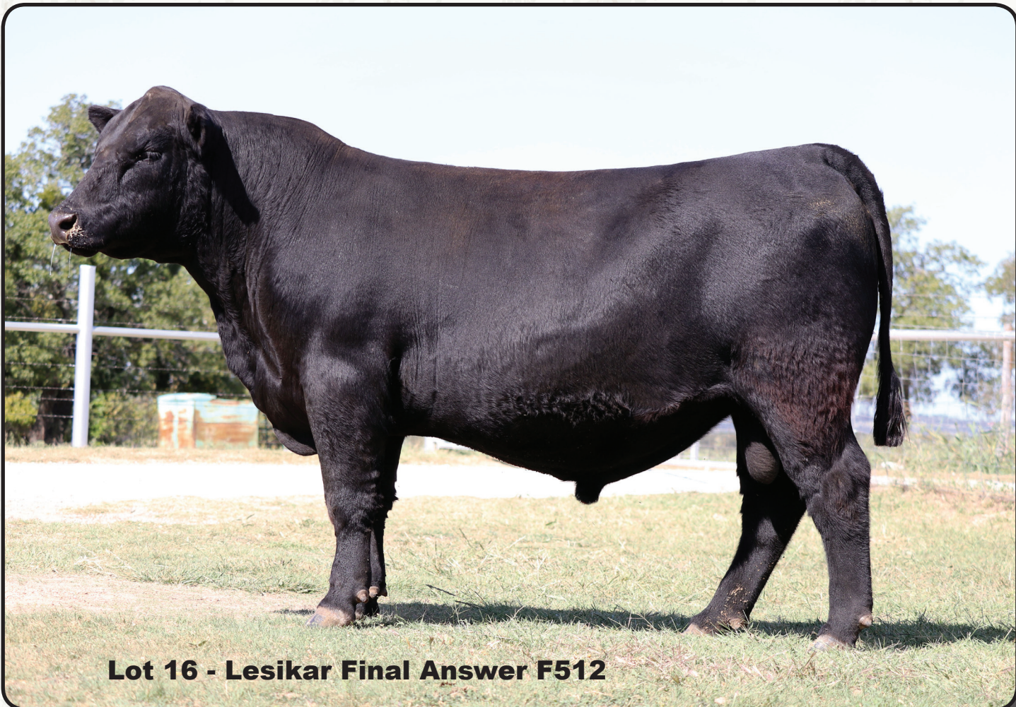
Lot 16 - Lesikar Final Answer F512