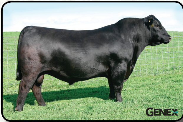
Sire of Lot 58