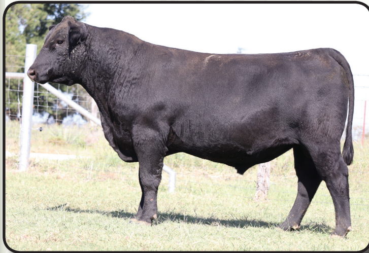
Lot 9 - Lesikar Payweight F336