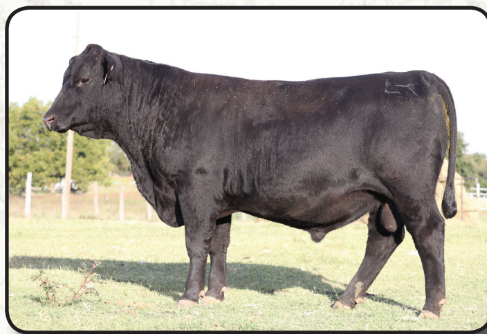
Lot 64 - Lesikar Emblazon G591