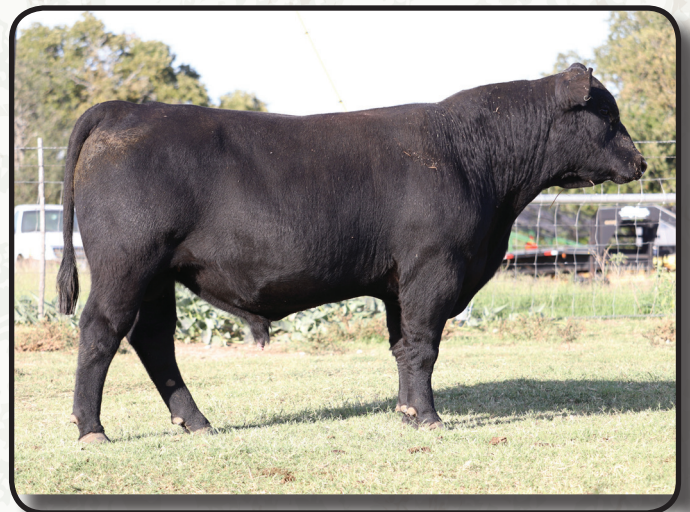
Lot 10 - Lesikar Payweight F351