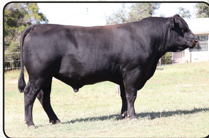
Lot 4 - Lesikar Consensus F313