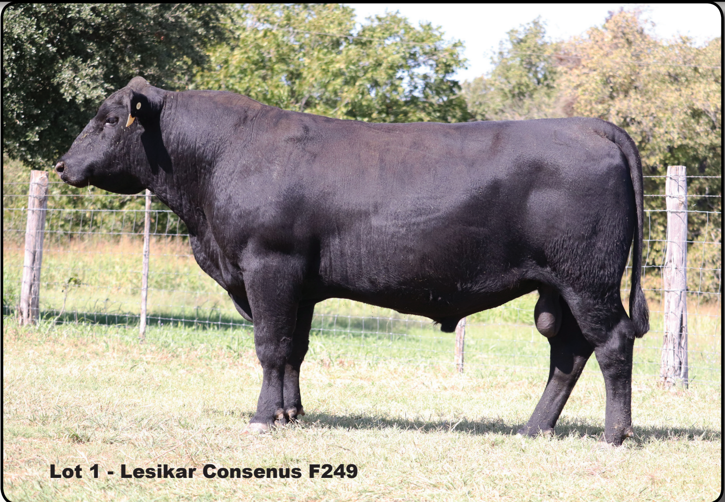
Lot 1 - Lesikar Consensus F249