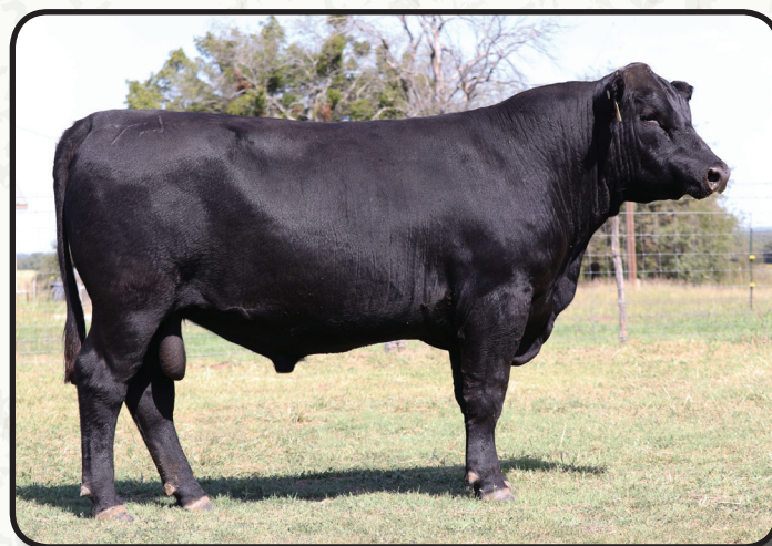
Lot 67 - Lesikar Practical G557