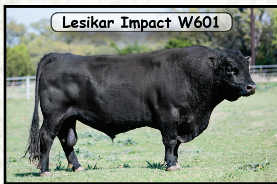
Lesikar Impact W601