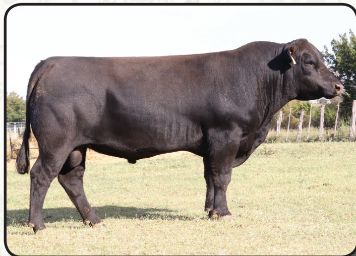
Lot 26 - Lesikar Broadside F242