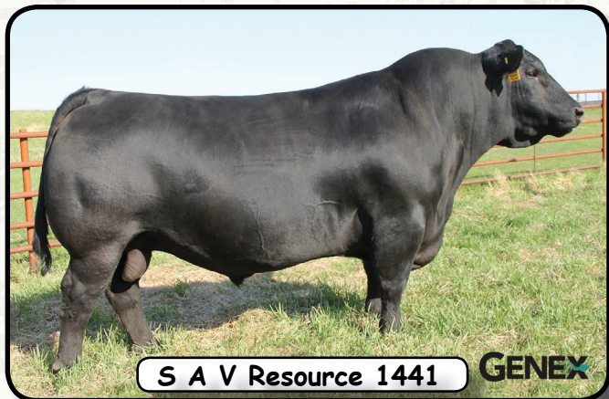
S A V Resource 1441