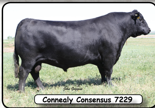
Connealy Consensus 7229