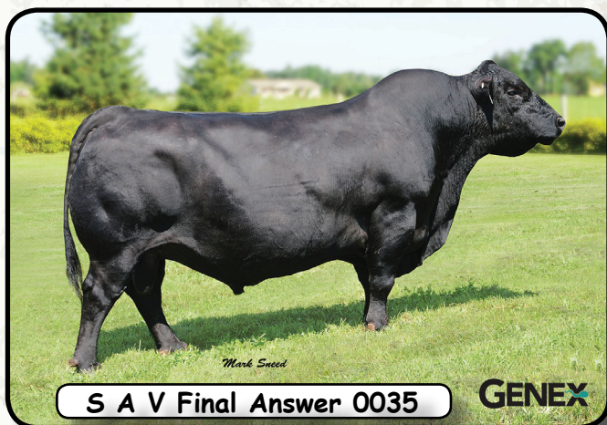
S A V Final Answer 0035