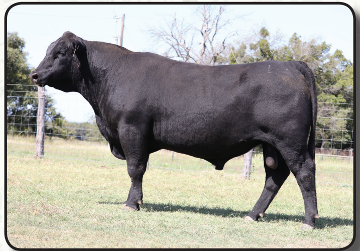
Lot 55 - Lesikar Practical G553