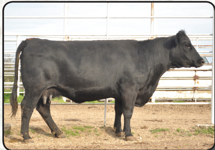
Lesikar Barbara B584 • Sells as Lot 1