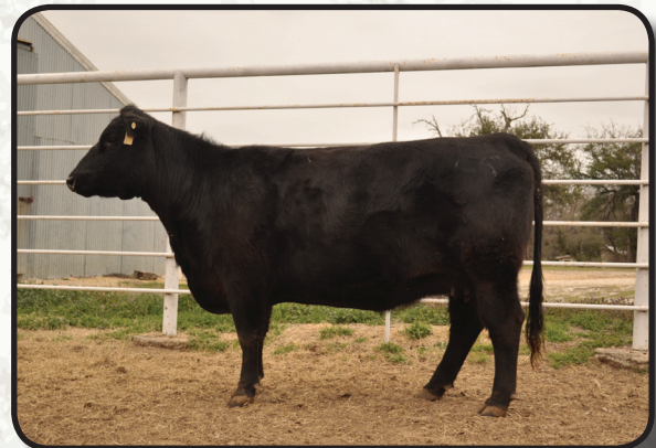
Lesikar Erica C648 • Sells as Lot 25