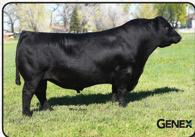
Schiefelbein Effective Sire of Lot 19A