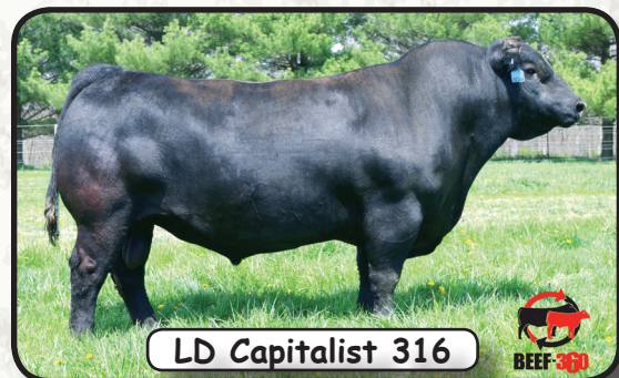
LD Capitalist 316