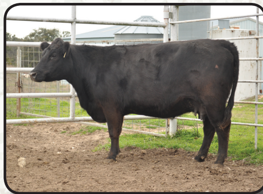
Lesikar Primrose B583 · Sells as Lot 29