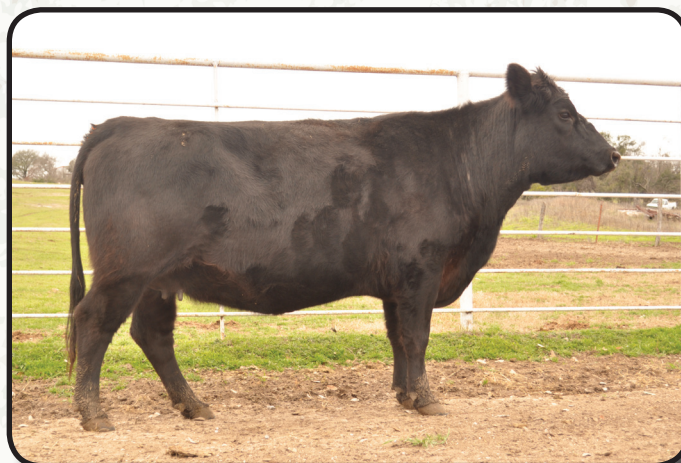
Lesikar Blackcap C661 • Sells as Lot 9

AI Bred to LD Capitalist 316 on January 10, 2020.