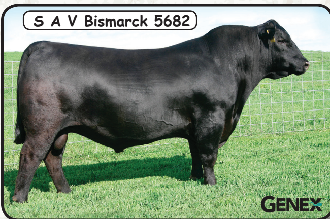
AI Bred to Lot 50 & 64