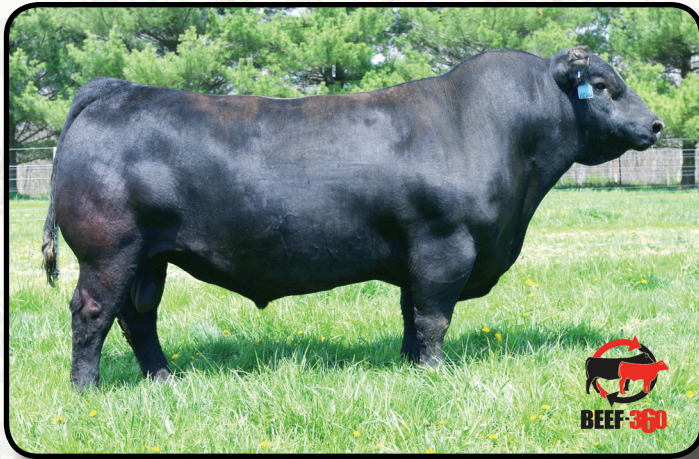
Lots 55-61 AI Bred to LD Capitalist