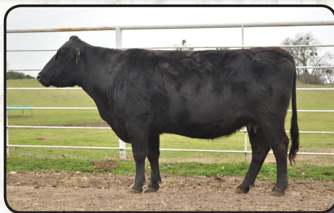
Lesikar Erica B559 • Sells as Lot 49

AI Bred to LD Capitalist 316 on January 10, 2020. Safe in calf. Due October 19, 2020.