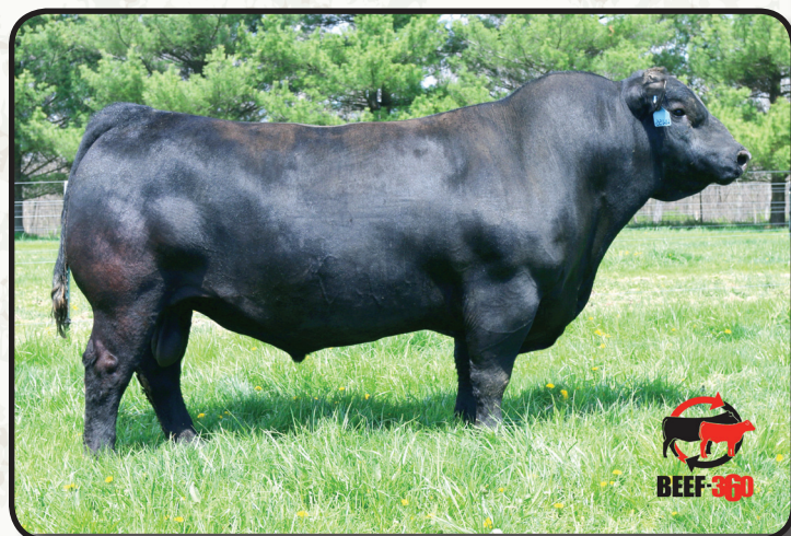
Lots 2, 3 and 4 AI bred to LD Capitalist 316

AI Bred to LD Capitalist 316 on November 11, 2019. Safe in calf. Due August 20, 2020.