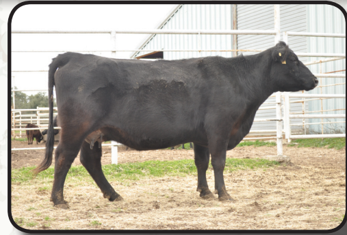
Lesikar Primrose C665 • Sells as Lot 30