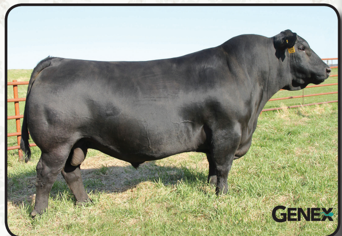
S A V Resource 1441 · Sire of Lot 17A

AI Bred to S A V Resource 1441 on November 12, 2019. Safe in calf. Due August 21, 2020.