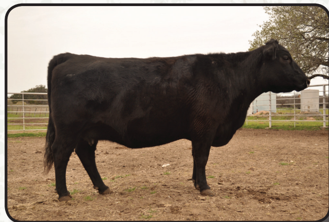
Lesikar Lady Z388 • Sells as Lot 43

Due to calve, pasture exposed July 4, 2019 thru August 24, 2019 to Lesikar Eureka Z371.