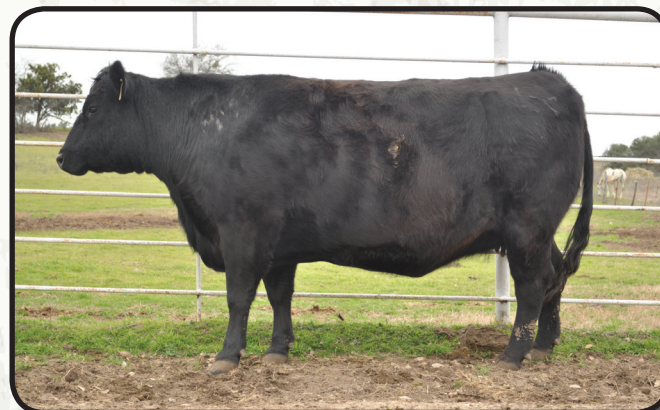
Lesikar Primrose Z318 • Sells as Lot 42

Due to calve, pasture exposed May 22, 2019 thru August 19, 2019 to Lesikar Broadside B545.