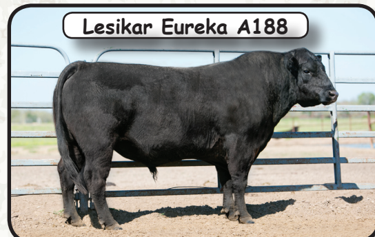
Lesikar Eureka A188