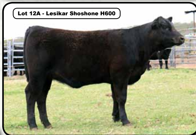
Lot 12A - Lesikar Shoshone H600