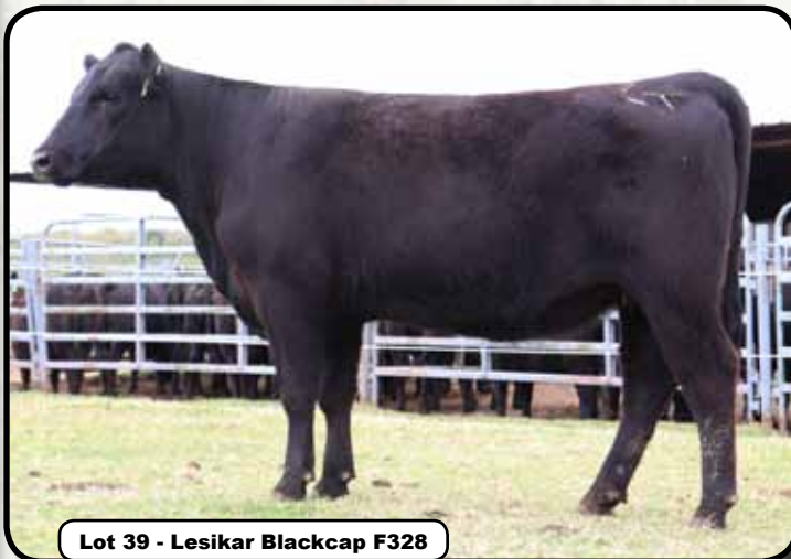
Lot 39 - Lesikar Blackcap F328