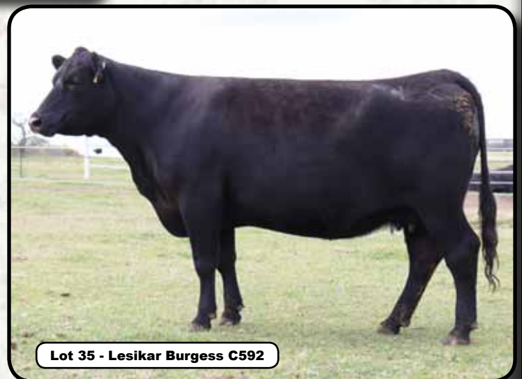
Lot 35 - Lesikar Burgess C592

Safe in Calf to S A V Pioneer, due on August 13, 2021