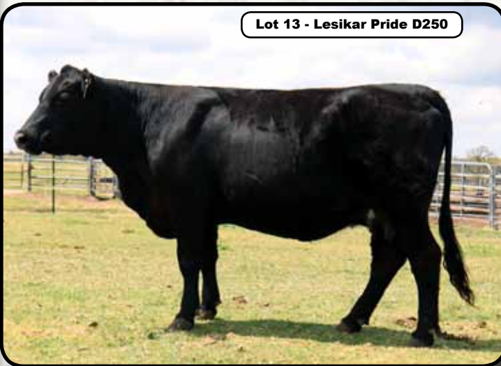
Lot 13 - Lesikar Pride D250