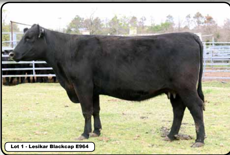
Lot 1 - Lesikar Blackcap E964

A Plus Blackcap 0037 is another great foundation donor of the Lesikar Ranch Program. She is the result of one of the most successful matings to date of the great Pathfinder Sire N Bar EXT with the legendary Pathfinder Dam GAR Scotch Cap 867. Full sisters to 0037 include the $120,000 GAR EXT 2114, the $300,000 GAR EXT 2104, and the $480,000 valuation Coleman Blackcap 0813. This outstanding donor ranks 2nd at Lesikar Ranch for progeny sold, bringing in almost $405,000. She is the Great Granddam of Lot 1.