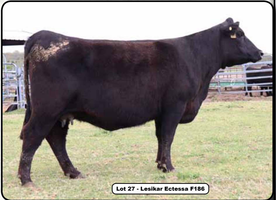
Lot 27 - Lesikar Ectessa F186

Due to calve on May 2, 2021 to 5682 - Bismarck.