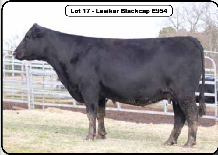
Lot 17 - Lesikar Blackcap E954