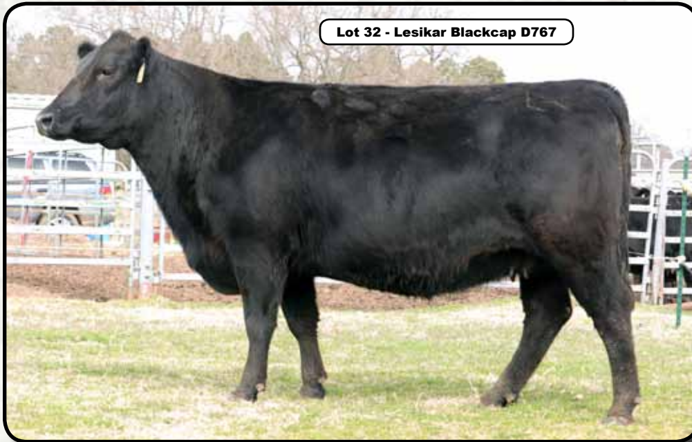
Lot 32 - Lesikar Blackcap D767

Safe in Calf to Deer Valley Growth Fund, due on September 1, 2021