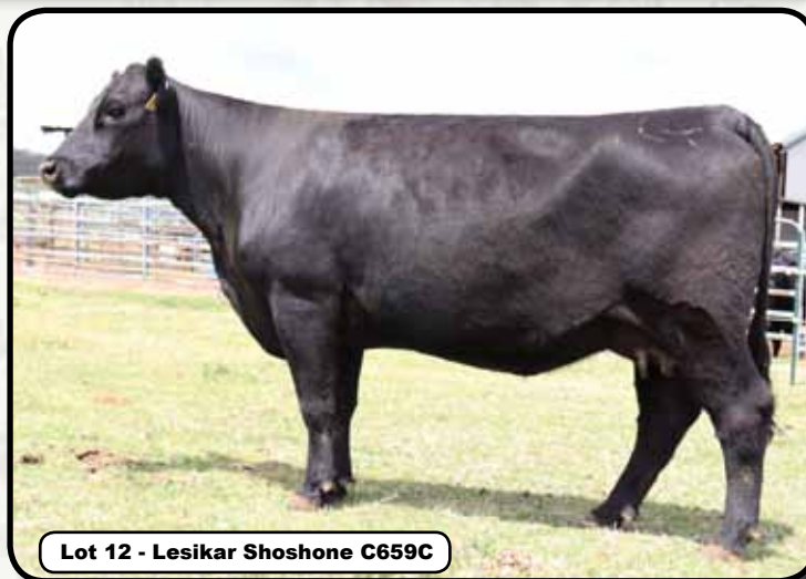
Lot 12 - Lesikar Shoshone C659C

Safe in Calf to Deer Valley Growth Fund, due on August 19, 2021