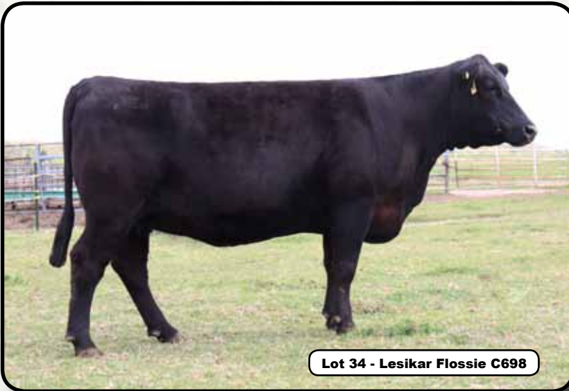
Lot 34 - Lesikar Flossie C698

Bred to Deer Valley Growth Fund on January 19, 2021.