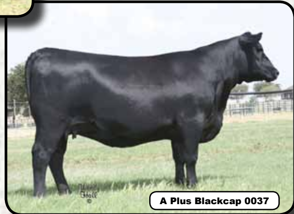
A Plus Blackcap 0037

A Plus Blackcap 0037 is another great foundation donor of the Lesikar Ranch Program. She is the result of one of the most successful matings to date of the great Pathfinder Sire N Bar EXT with the legendary Pathfinder Dam GAR Scotch Cap 867. Full sisters to 0037 include the $120,000 GAR EXT 2114, the $300,000 GAR EXT 2104, and the $480,000 valuation Coleman Blackcap 0813. This outstanding donor ranks 2nd at Lesikar Ranch for progeny sold, bringing in almost $405,000. She is the Great Granddam of Lot 1.