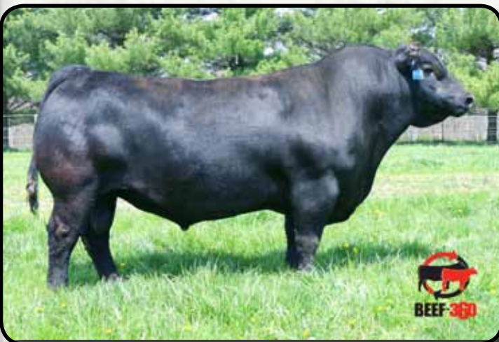
LD Capitalist 316 Sire of Lot 11A

For video of the Sale Cattle, please visit us at: