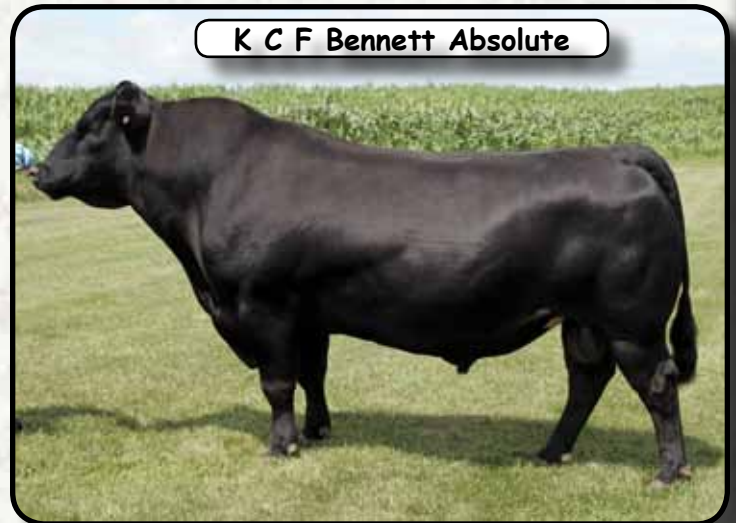
Sire of Lot 26A