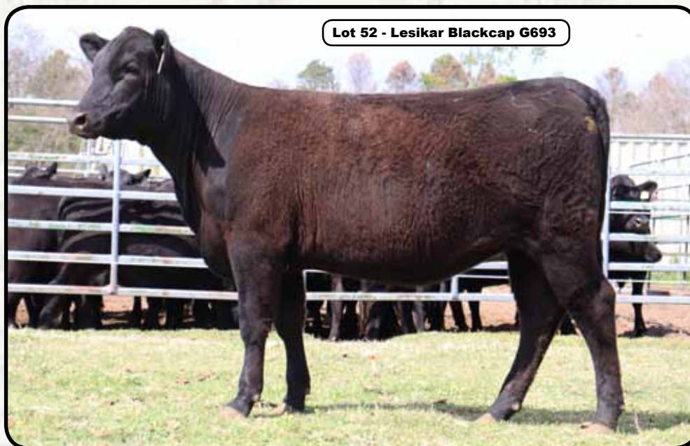
Lot 52 - Lesikar Blackcap G693