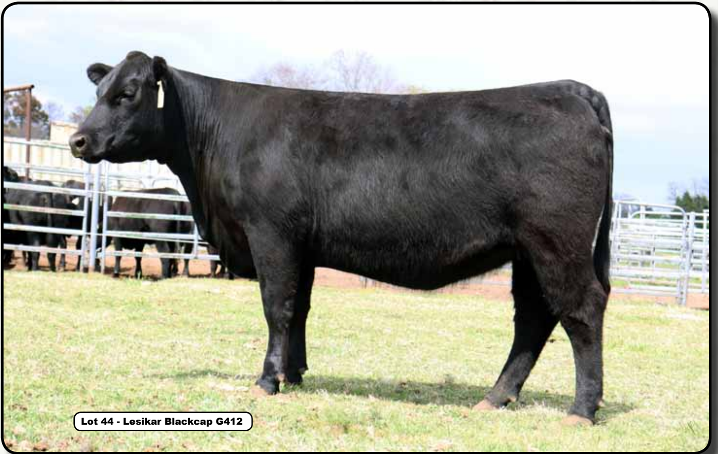
Lot 44 - Lesikar Blackcap G412