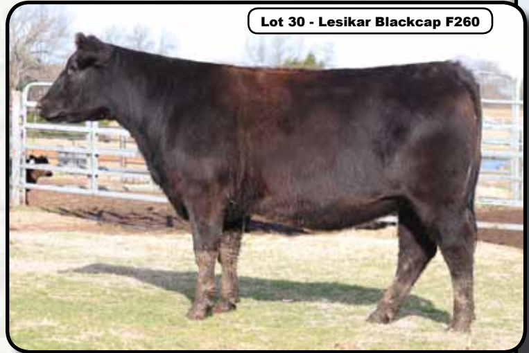
Lot 30 - Lesikar Blackcap F260

Safe in Calf to Deer Valley Growth Fund, due on September 1, 2021