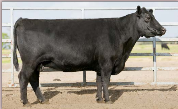
G A R Objective 1765 - Maternal granddam of Lot 6