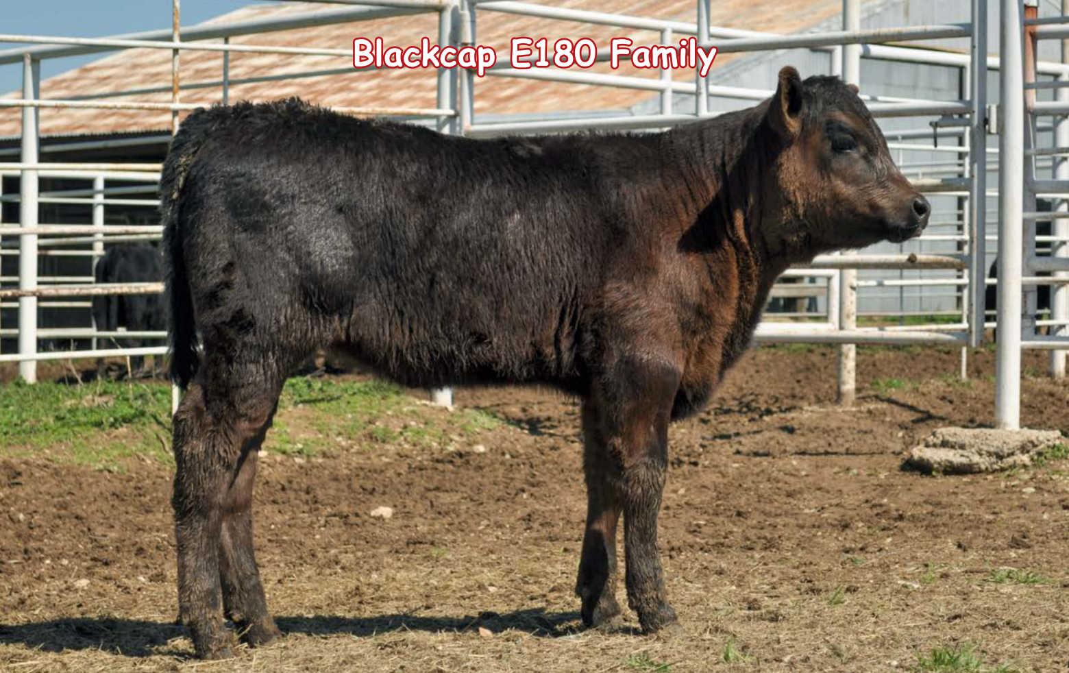
Lesikar Blackcap K283 - Lot 5