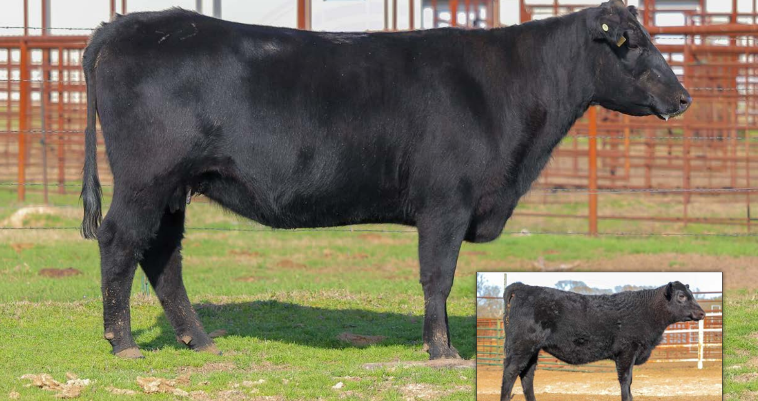
Lesikar Blackcap F248 - Lot 16