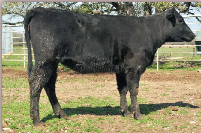
Lesikar Eva J988 - Lot 68