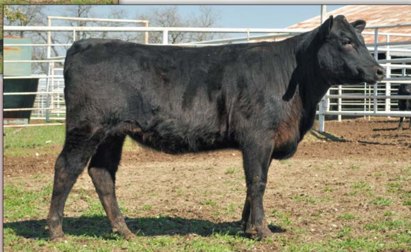
Lesikar Rita J979 - Lot 67