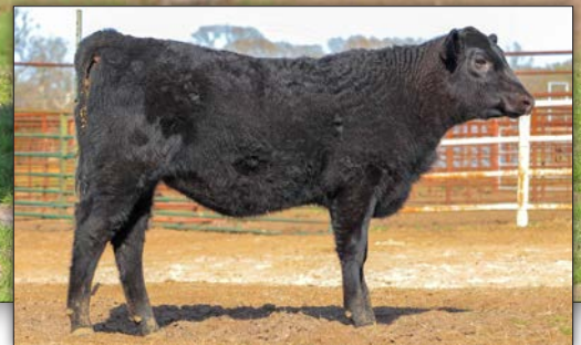
Lesikar Blackcap K882 - Lot 16A