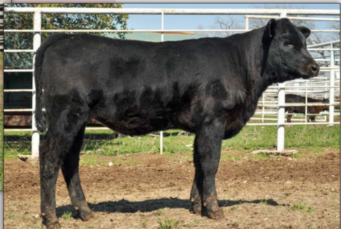
Lesikar Blackcap K240 - Lot 4