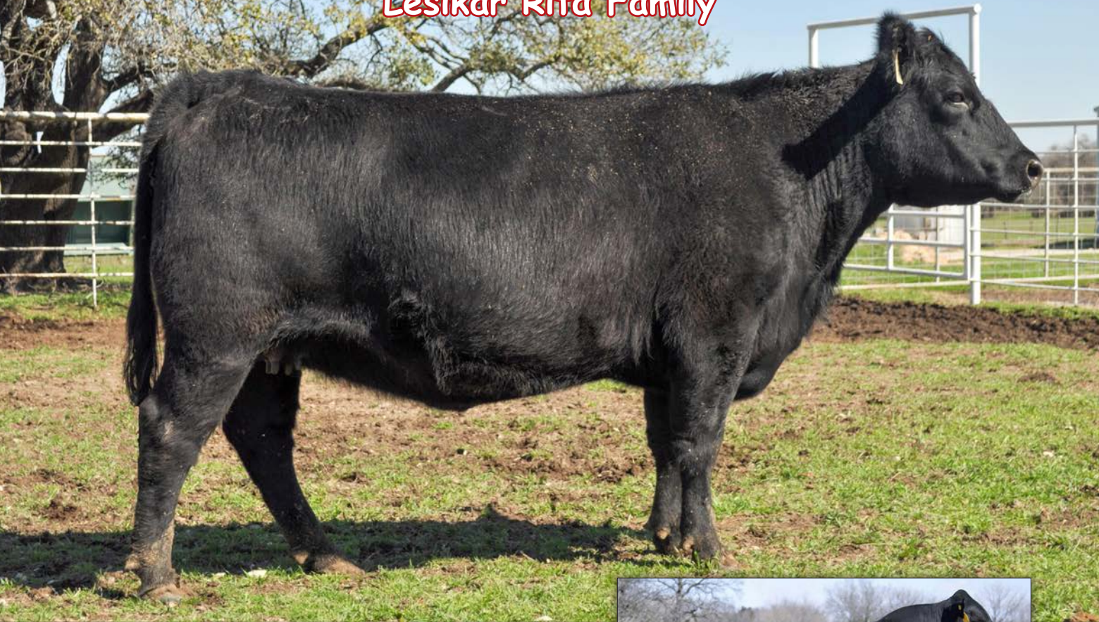
Gabriel Rita 8441 - Dam of Lots 1 & 2