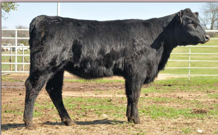
Lesikar Total Discovery K133 - Lot 78