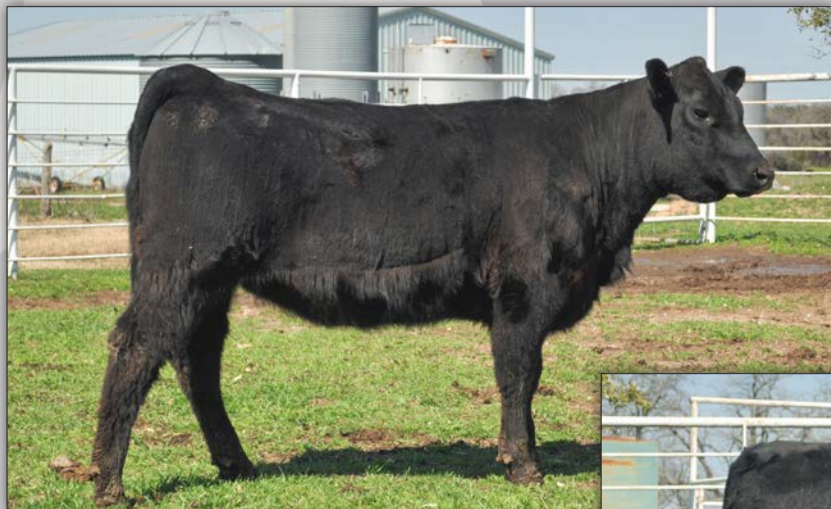
Lesikar Donna J976 - Lot 66