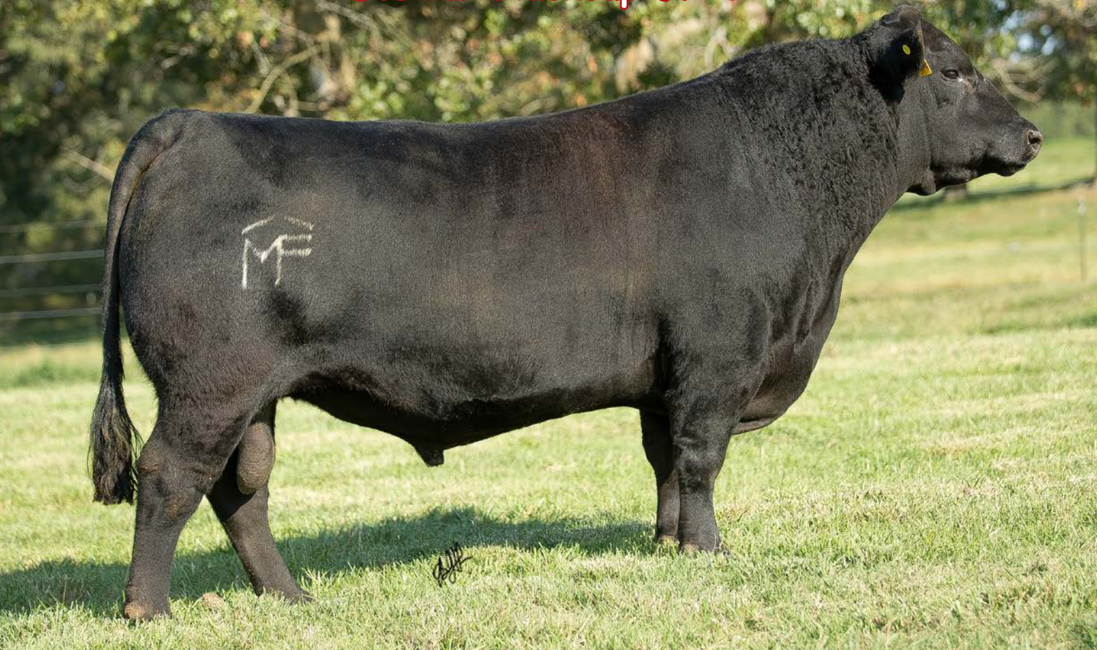
Mead Perseverance R1266 - Sire of Lot 6