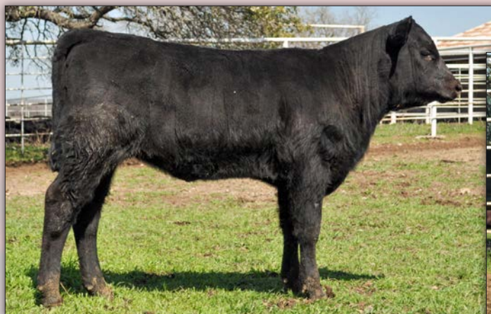
Lesikar Blackcap K239 - Lot 3