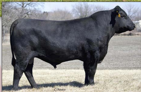
E W A Peyton 642 - Sire of Lot 1