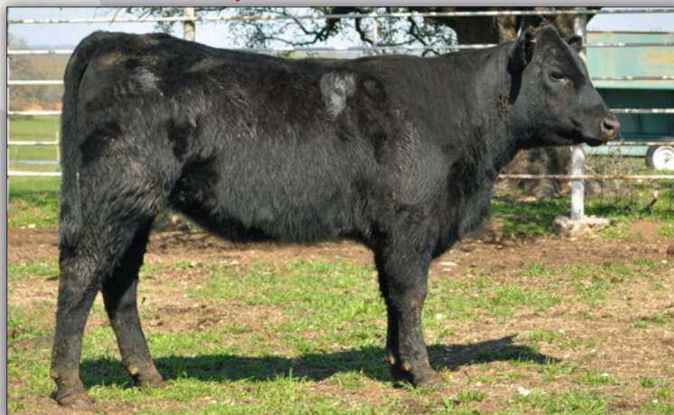
Lesikar Rita K140 - Lot 79