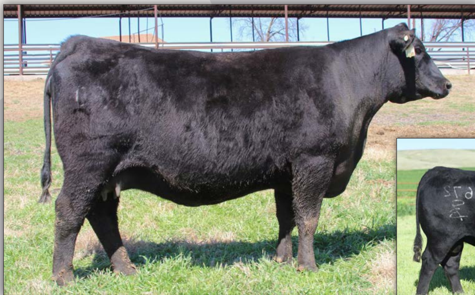
Dean's Blackcap E180 - Dam of Lots 3-5