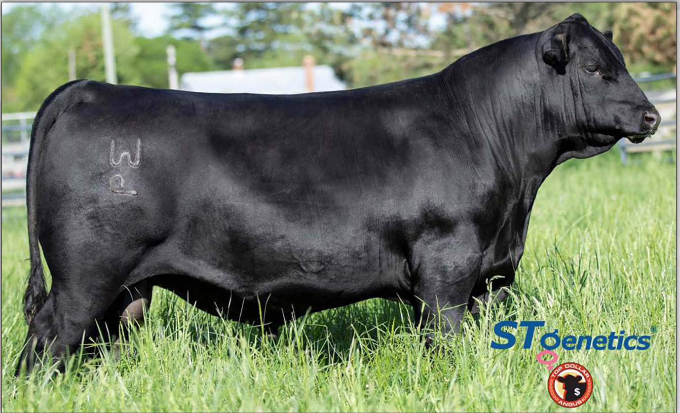
Poss Winchester - Sire of Lot 2