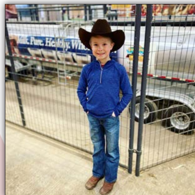
Lesikar Burgess J715 - Lot 62