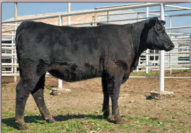
Lesikar Britta May K118 - Lot 72