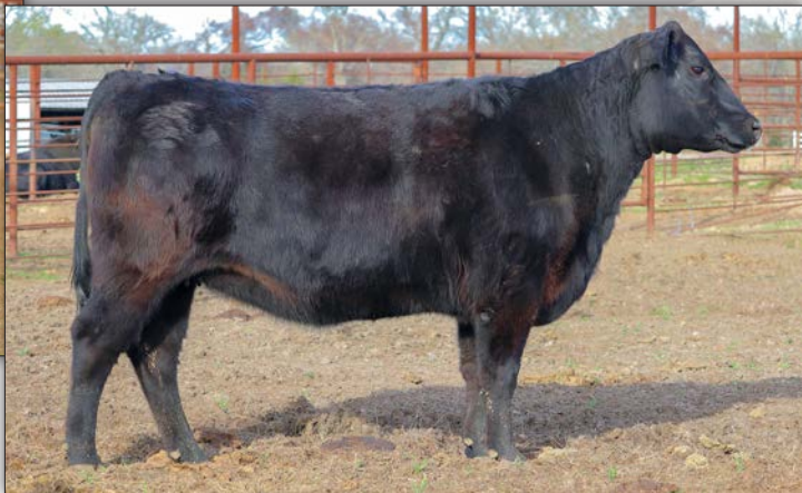
Lesikar Blackcap G416 - Lot 50