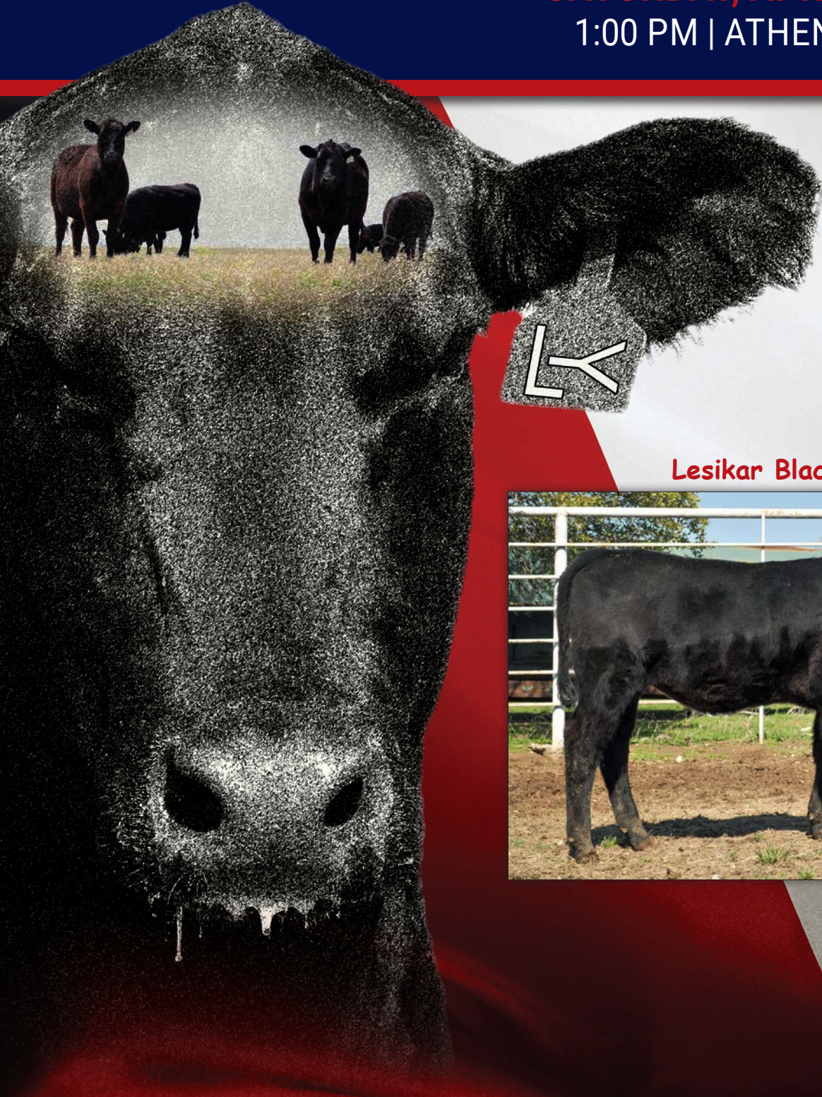
Lesikar Blackcap K240 - Lot 4