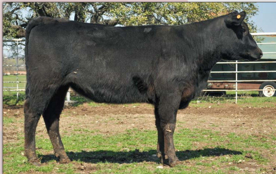
Lesikar Rita J977 - Lot 1