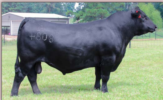
AF Magnum AI 8084 - Sire of Lot 5