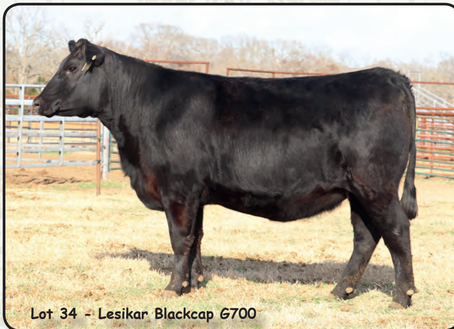
Lot 34 - Lesikar Blackcap G700

Safe in calf to BJ Surpass, due on 8/11/2022