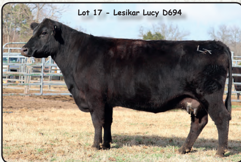
Lot 17 - Lesikar Lucy D694