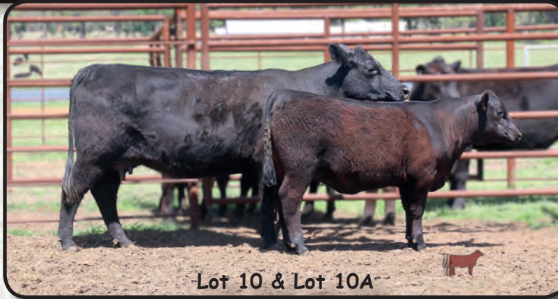
Lot 10 & Lot 10A