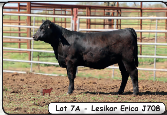
Lot 7A - Lesikar Erica J708

Safe in calf to Deer Valley Growth Fund, due on 11/30/2022