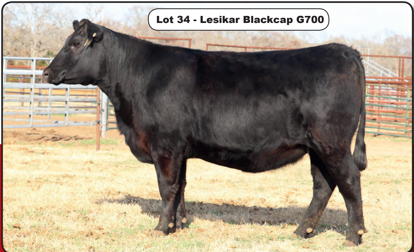
Lot 34 - Lesikar Blackcap G700