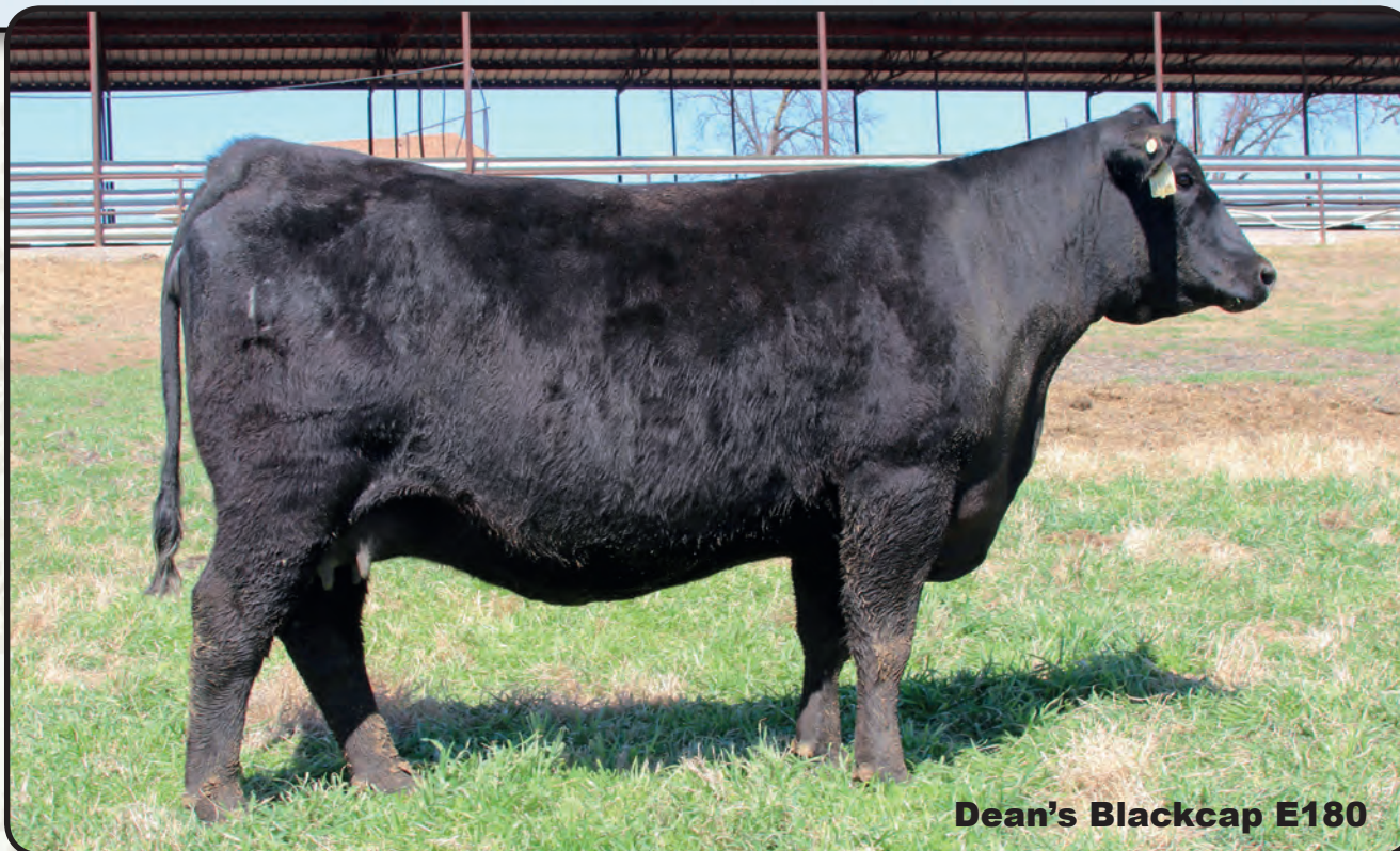
Dean's Blackcap E180