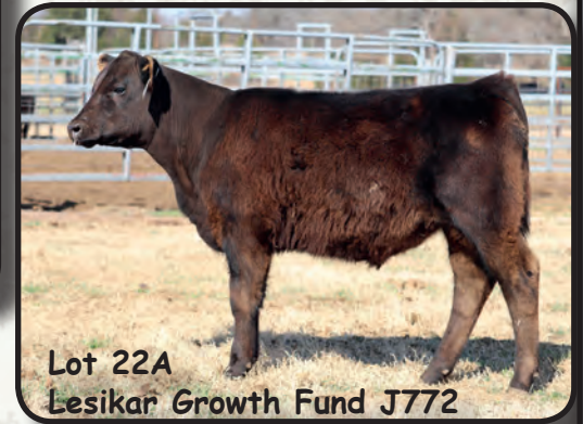
Lot 22A Lesikar Growth Fund J772