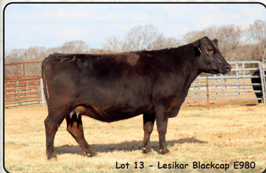
Lot 13 - Lesikar Blackcap E980