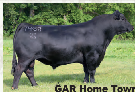
GAR Home Town