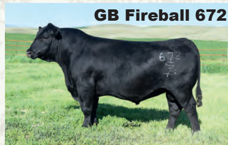
GB Fireball 672