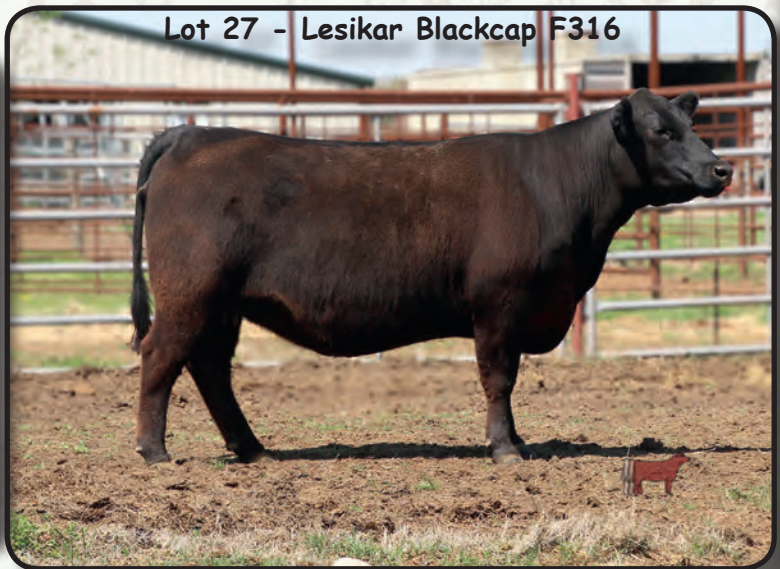
Lot 27 - Lesikar Blackcap F316