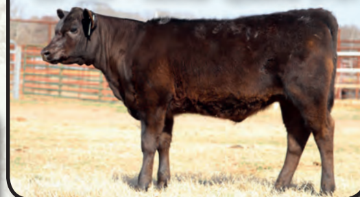
Lot 12A - Lesikar Queenie J781