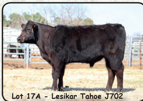
Lot 17A - Lesikar Tahoe J702