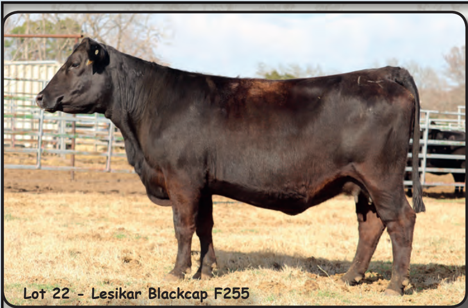
Lot 22 - Lesikar Blackcap F255