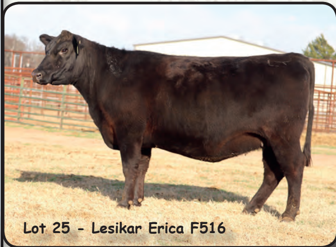
Lot 25 - Lesikar Erica F516

Safe in calf to GAR Home Town, due on 8/16/2022