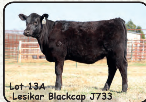
Lot 13A - Lesikar Blackcap J733