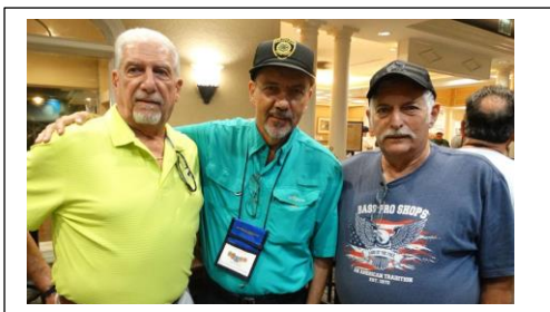
Members of the Reunion Committee