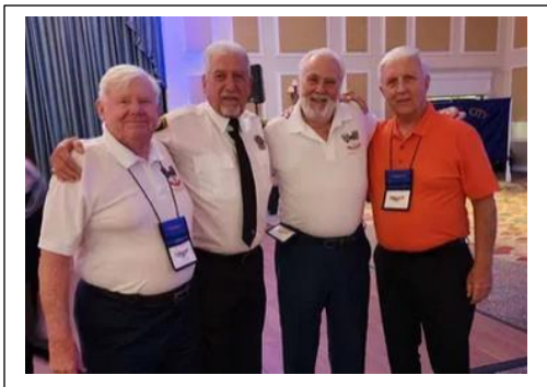
Members of the Hernando 10-13 Board

Several members of the Hernando 10-13 Club attended the 25 th anniversary of the Transit Police Florida Reunion at the Radisson Hotel at Cape Canaveral between July 23 th thru July 27 th .