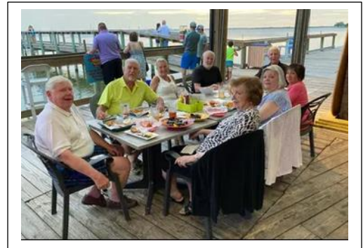
Dinner @ Cocoa Beach