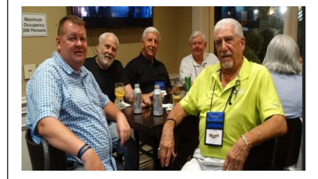
Having a few adult beverages after dinner.

Additional photos available at www.transitpolicereunion.com In addition, information regarding the 2024 reunion will be updated regularly at www.transitpolicereuion.com . Looking forward to your attendance next year.