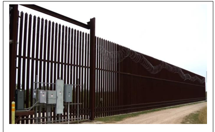
View of uncompleted border wall