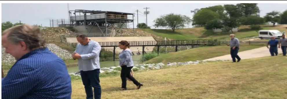
Pastors praying at the Crossing Where Numerous Aliens have drowned while attempting to cross the Rio Grande