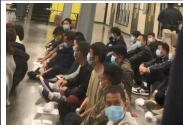
Multiple Military Aged Men mostly from countries other than South America