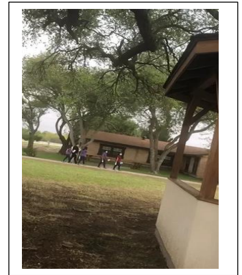
Illegals in processing center