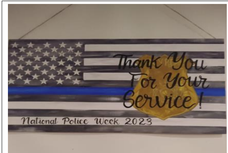
Plaque presented by Fairway Pizza to Suncoast 10-13