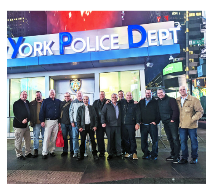
Active and retired members of New York's Finest at their 18-month annual get-together in Midtown South Manhattan.