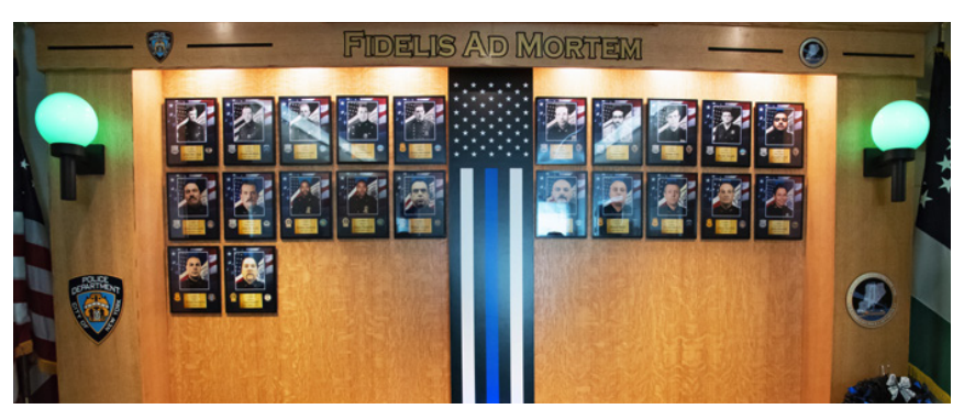
The PBSI memorial wall.

ON SEPTEMBER 19, 2021, Patrol Borough Staten Island hosted the 6th Annual Staten Island Remembers Ceremony. Family, members of the service, community members, and officials, gathered at the 121 Precinct to pay tribute to officers who were killed in the line of duty, and who were assigned to or resided in Staten Island. The day's event concluded with a Wall Dedication that honored the memory of all 22 Staten Island officers, as well as a Family Day gathering.