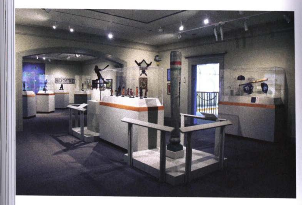
FIG. 3: The Art of Baseball exhibit in the Wallace Kane Gallery at the Concord Museum.