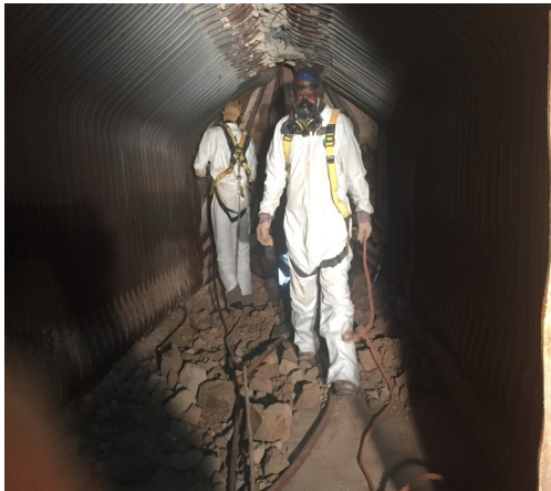
Refractory removal Galata Chemicals, LLC