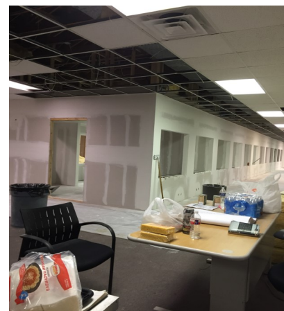
Renovation of Social Security office U.S. Social Security Administration