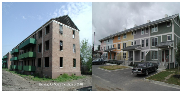
Florida PH redevelopment City of New Orleans