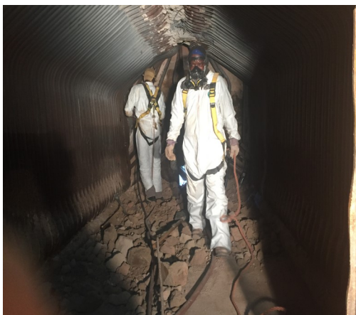
Refractory removal Galata Chemicals, LLC