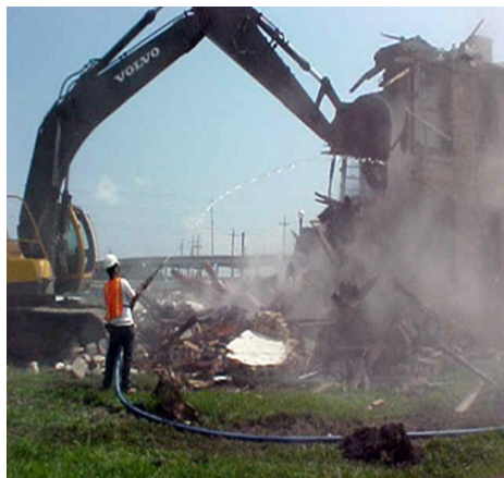
New Orleans Ninth Ward Demolition Ninth Ward Redevelopment Association