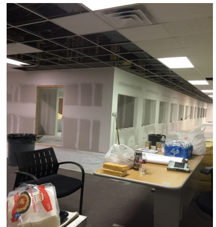
Renovation of Social Security office U.S. Social Security Administration