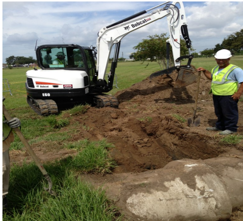
Drainage line point repairs NASA Michoud Assembly Facility