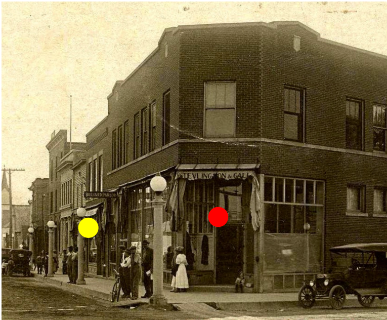
This photo, taken about 1918, shows South Main Street in Westby. The entrance of Flugstad Hardware was at ● and the entrance to Stevlingson & Call was at ●.

* Editor's Note: Flugstad Hardware, started in 1890, was located at 112 S. Main Street when this move took place!