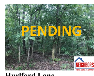
Hurlford Lane Bella Vista MLS # 1154897 $4,000.00