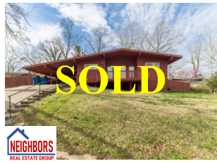
SOLD NEIGHBORS REAL ESTATE GROUP 10 Finger Circle Bella Vista MLS # 1179873 $160,000.00