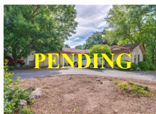
PENDING 18 Melbourn Drive Bella Vista MLS # 1187292 $183,500.00