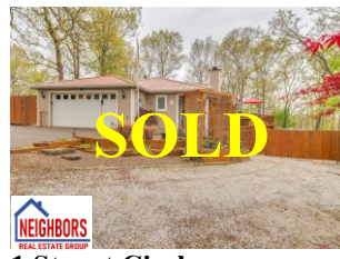
SOLD NEIGHBORS REAL ESTATE GROUP 1 Stuart Circle Bella Vista MLS # 1181556 $255,000.00