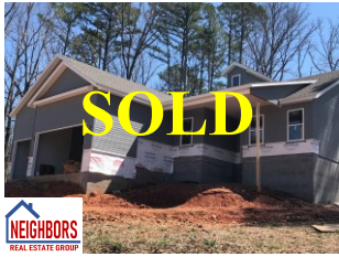
SOLD NEIGHBORS REAL ESTATE GROUP Radcliffe Drive Bella Vista NON-MLS Sale $282,139