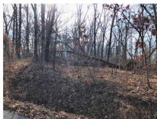
SOLD Rountree Drive Bella Vista MLS # 1172329 $10,000.00