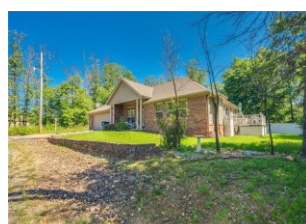
SOLD 26 Nantwich Circle Bella Vista MLS # 1188119 $240,000.00