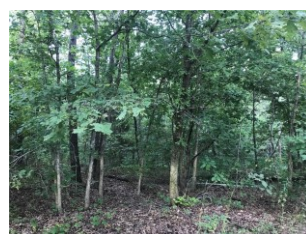
SOLD Hurlford Lane Bella Vista MLS # 1154897 $4,000.00