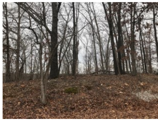
SOLD Cullen Hills Lane Bella Vista MLS # 1137327 $12,000.00