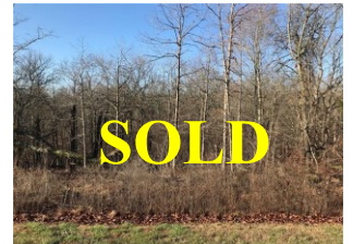
SOLD Fountainhall Lane Bella Vista MLS # 1178260 $4,500.00