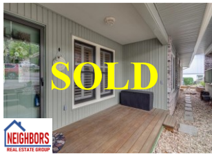
SOLD NEIGHBORS REAL ESTATE GROUP 1 Kenneth Circle Bella Vista MLS # 1184464 $165,000.00