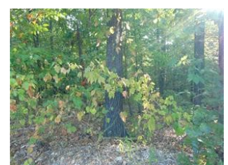
SOLD Kettering Circle Bella Vista MLS # 1187953 $12,000.00

coming soon >>> 4th of July Patriots Parade Allen's Food Parking Lot – July 3 rd 9:00 AM Pre parade-entertainment. / 9:30 AM Parade