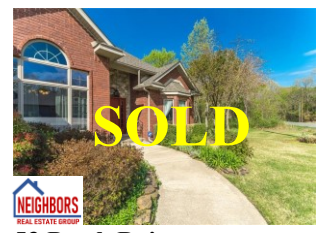
SOLD NEIGHBORS REAL ESTATE GROUP 53 Perth Drive Bella Vista MLS # 1180669 $350,000.00