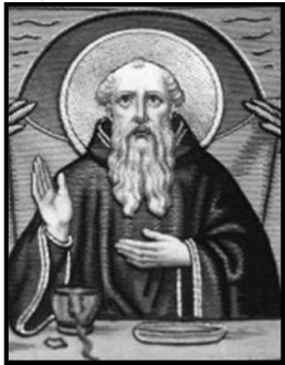
Saint Benedict, Pray for us!