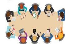
A Simple Structure for Missional Effectiveness

What: Simplified Accountable Structure Workshop