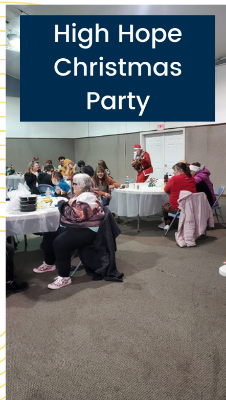
High Hope Christmas Party