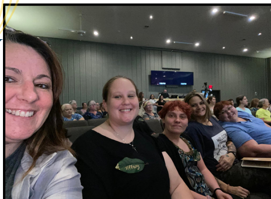
2023 NOMO Women's Retreat

Some of us went to a District Women's Conference, did Secret Sister, had a great Christmas party, and hosted the 6th annual High Hope Christmas party. We are currently discussing what our 2024 year will look like and pray it becomes our best year yet.