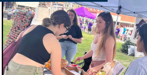
Truman Student Welcom