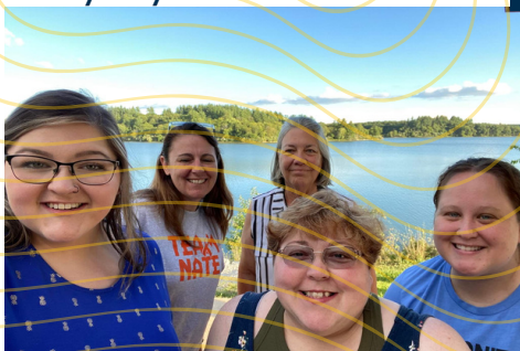
She Believes Fellowship at Thousand Hills