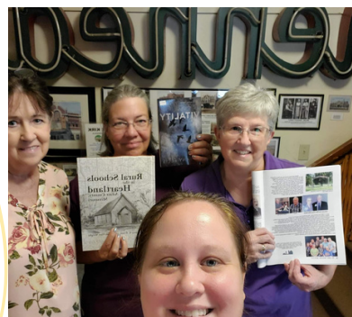
She Believes Fellowship at the Historical Society