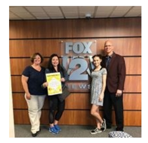
Promo on Fox 2 News

Find more information on our website at http://www.wbyouthassistance.org