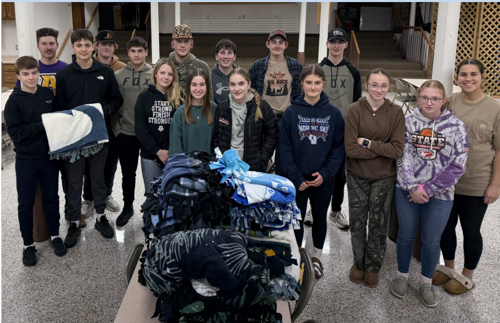
Project Linus donation by youth of Our Lady of the Lake.

High school youth in Faith Formation at Our Lady of the Lake recently participated in the annual Project Linus service activity.