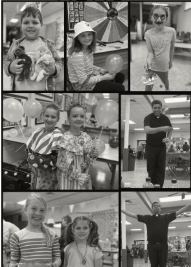
Thank you for making the Spring Carnival successful & fun!