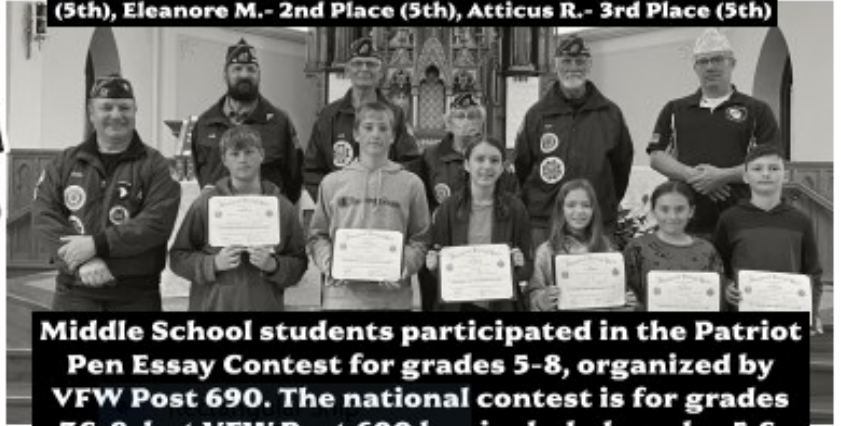
Middle School students participated in the Patriot Pen Essay Contest for grades 5-8, organized by VFW Post 690. The national contest is for grades 7& 8, but VFW Post 690 has included grades 5 & 6, on a local level. All winners were recognized by the Chequamegon Veterans.