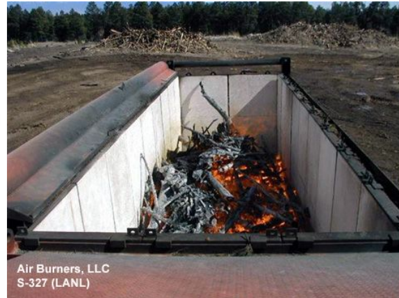
Left: Air Burner principle of operation. Right: Air Burner S-327 unit in operation.

The US Forest Service San Dimas Technology and Development Center (SDTDC) investigated Air Curtain Burners and recommended their use for incinerating forest waste with low emissions (Schapiro 2002). An in-depth analysis of air curtain burner emissions came to similar conclusions but also found that in some cases the air curtain burners produced very low particulate emissions even when the blower was turned off (Miller & Lemieux 2007). The authors noted: "It is very likely that even poorly operated systems will exhibit significantly lower PM emission levels when they are able to increase the high-temperature residence time of the pyrolyzed organics that form most of the fine PM." This has implications for our proposed modified use of the units to produce biochar.