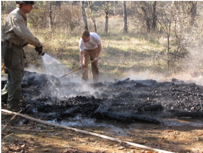
Open Rick Burn in a forest: a rick made of fir and pine from an oak meadow restoration project in Oregon. As the outside of each log burns, the inside chars. When fully charred, the rick collapses and can be quenched with water or dirt to save the char.