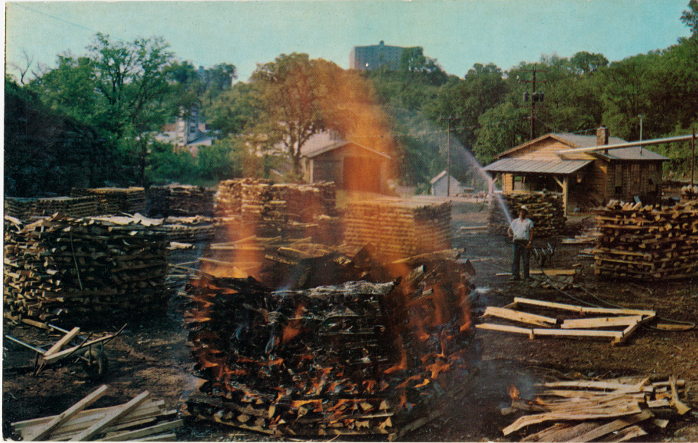
Jack Daniels Rick Method. Making charcoal for the Jack Daniels Distillery using open ricks.

Another inspiration is the “rick” method of making biochar, used by the Jack Daniels Distillery to make charcoal for filtering their whisky. The “rick” is an open pile of criss-crossed lumber that maintains air voids within the pile. The rick pile is lit from the top. The open rick structure allows flame to envelope each stick, burning the outside and charring the inside. When all the sticks are charred through, the pile collapses and it is quenched with water.