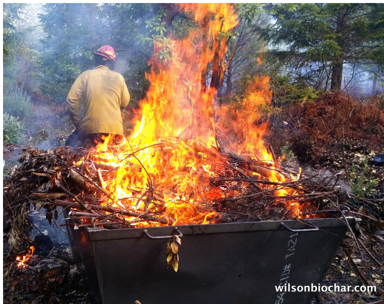
The Forestry Flame Cap Kiln. Designed by Wilson Biochar Associates for use in forestry to convert burn piles to biochar. Newer model will have fork pockets for lifting and unloading.

The Forestry Flame Cap Kiln is a very simple, low cost device based on the Japanese Cone Kiln described above. WBA designed this version of the Flame Cap Kiln to be optimized for low cost manufacturing and for efficient logistical deployment and use along forest roads as an alternative to pile burning or chipping. Basically, it is a method of improving the efficiency and char recovery of the Rick Pile Burn by placing it inside a container.