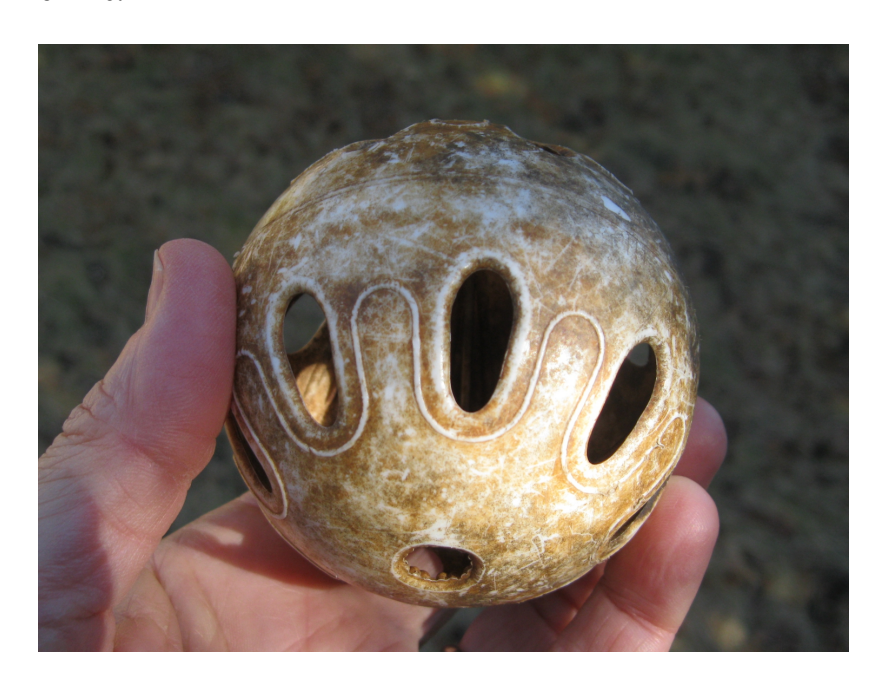
Jingle bell wiffle ball

Although this ADC humor is dark, I can not help but laugh. My son hasn't died; he has simply graduated from the school of life.