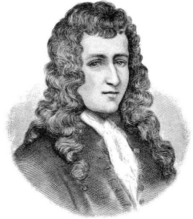
Robert de LaSalle

Robert de LaSalle was a French explorer who arrived in North America in 1666. He established a series of forts along the Mississippi River. While exploring the Mississippi, he gave the name “Louisiana” to the territory lying west of the river and claimed it in the name of France. During his travels, he also established the outpost that would eventually become Little Rock, Arkansas. Despite never exploring the actual Louisiana Territory, his actions were significant because it gave France a claim to this vast expanse of land.