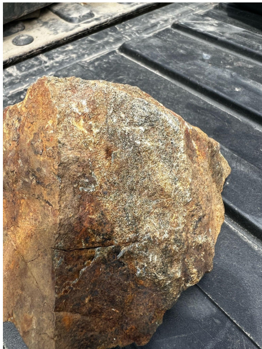
*sample ID #60

**Notable Intercepts and Samples in Bold