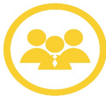
Limited Liability Company