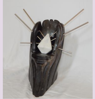
'Prominence' Wizard's Myst & white marbles, stainless steel rods