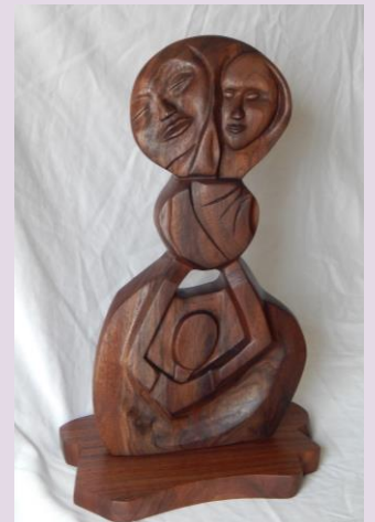
'Legacy Lift... Legacy Left' Black Walnut