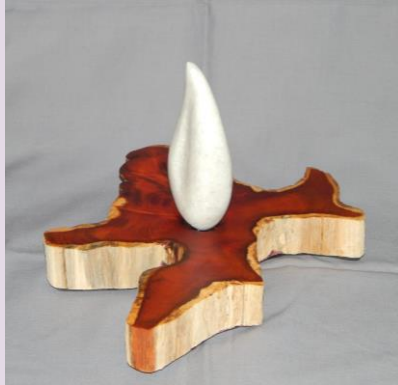
'A Simple Proposition' White Marble on Logwood