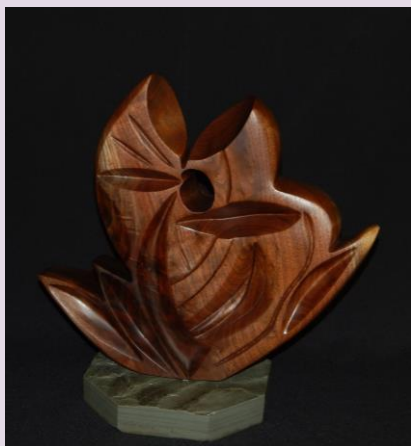
'Were It Not For Grace' Black Walnut on stone base