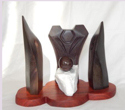
'Covering II' Blue Mahoe, Padouk, White-gray Marble