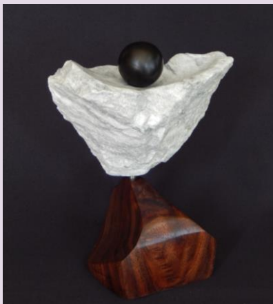
'Upper Crust' Grey/White & Black Stones Black Walnut