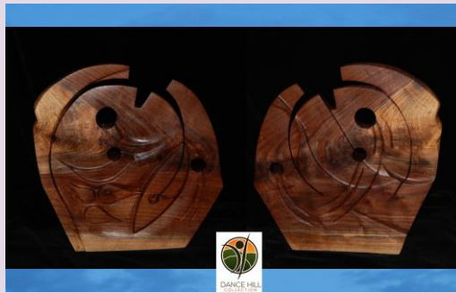
'So Much To Say... Again' Black Walnut