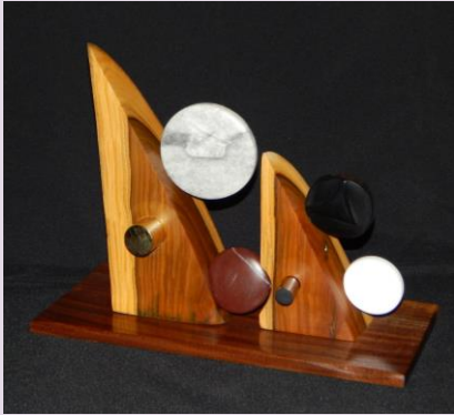
'Elemental Connections' Lignum Vitae & Black Walnut woods, various marbles, brass & steel