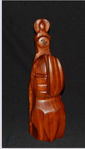
'Harkening' Wild Tamarind