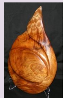
'Eye of The Beholder' Jamaican Cedar