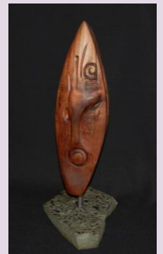
'Echoes III' Black Walnut Stone Base