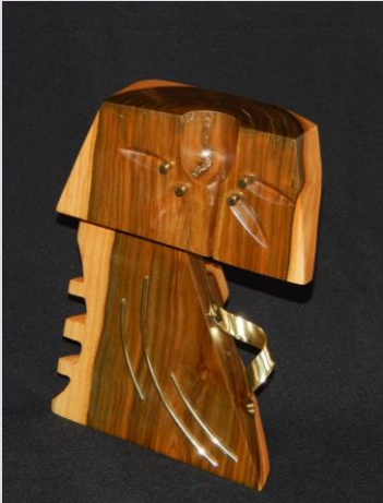
'Head Knowledge' Lignum Vitae & Brass