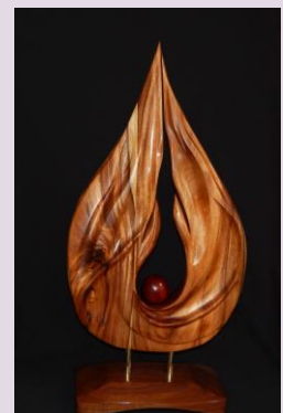
'The Flame' Guango, Black Walnut, Logwood