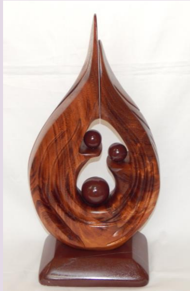
'Opus #3' Guango wood & Rossa Laguna Marble