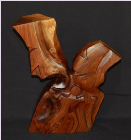
'Leader, Follower, Sidekick' Black Walnut