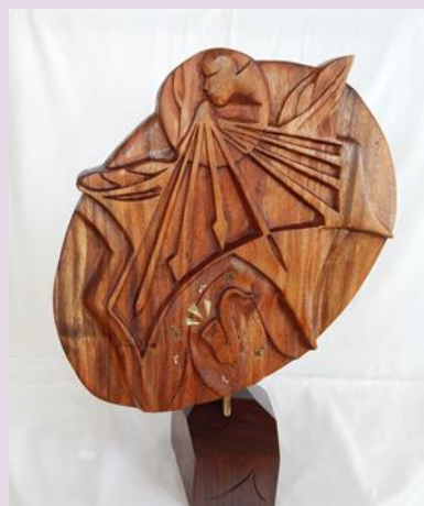
'Sunrise' Guango, Black Walnut & Brass