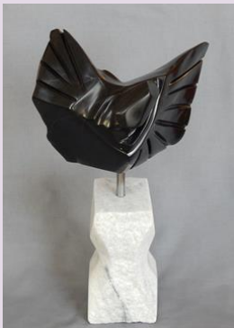
'Contemplating Flight' Black & White Marbles