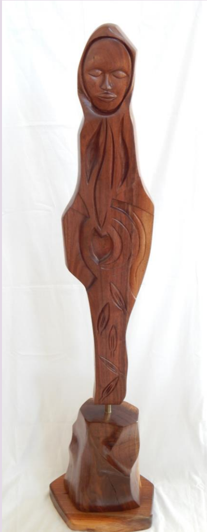
'Upbringing' Black Walnut

One of a kind Sculptures in Wood and Stone