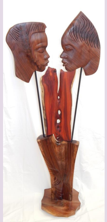
'Between You & Me' Black Walnut, Logwood, Steel Rods

Alpharetta, Georgia, USA / Woodside, St. Mary, Jamaica 856-503-8937 www.dancehillcollection.org ronvsul@gmail.com