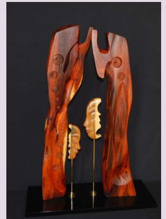
'Soul Sentinels' Logwood, Lignum Vitae & Brass