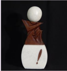
'Not So Foreign Bodies' South African Candlewood & White Marble

Dance Hill Collection came about more by accident than by design. One day while surfing the web I happened to come across a Shona sculpture, in stone, created by the hands of a Zimbabwean artist. I was immediately intrigued by the artistry, the craftsmanship, the imagination. Initially I wanted to import and sell Shona sculpture, exposing more people to this wonderful art; but that plan did not materialize and I ended up taking up sculpting stone myself.