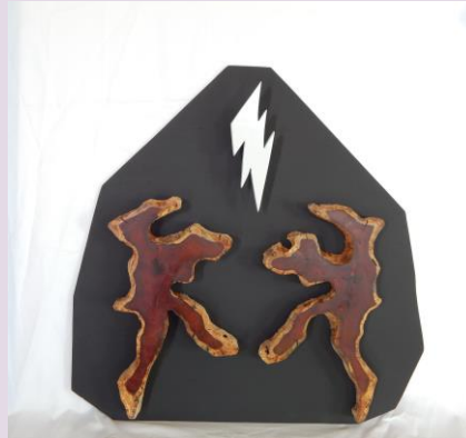
'Antagonistas' Logwood & Oak (Painted)