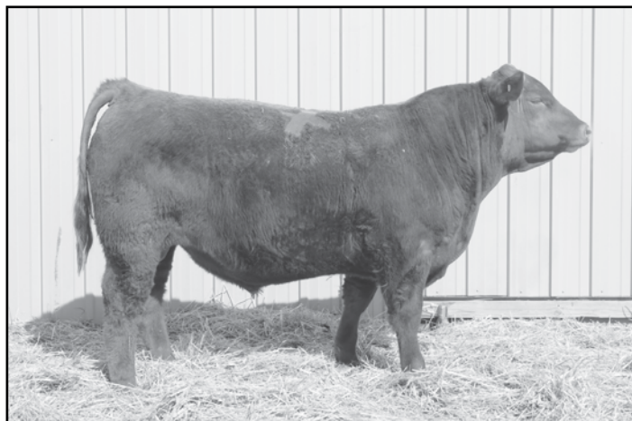
Kuhns Bond Z060