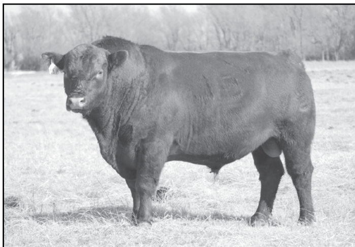
5L Legend 1553-425V