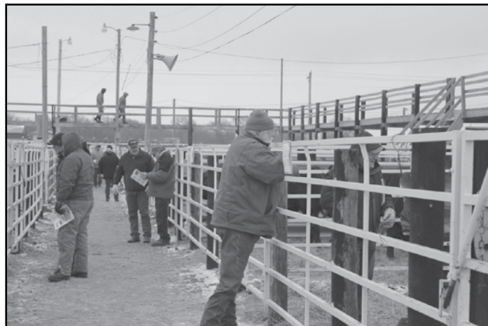
-12 degrees at last year's sale, but still a good crowd