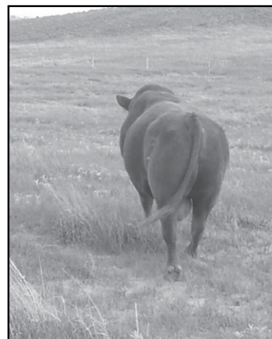
ARO Express 878