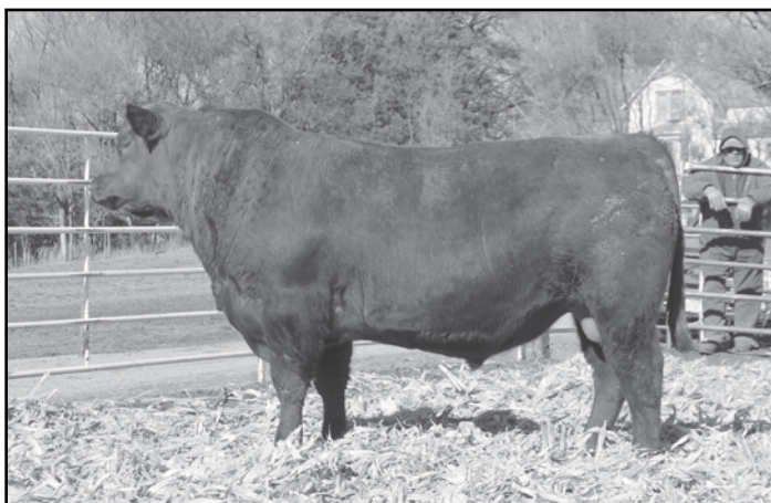
This top bull from the 2014 sale is a full brother to Lot 91.