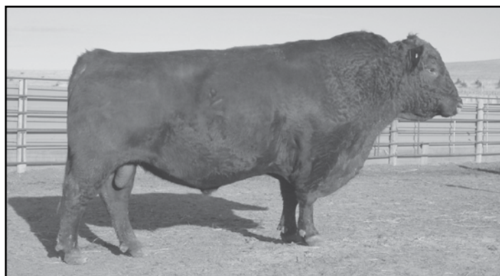
Mlk Crk Express 9127