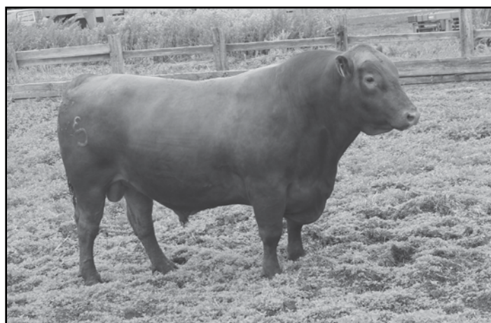
Messmer Jed V510