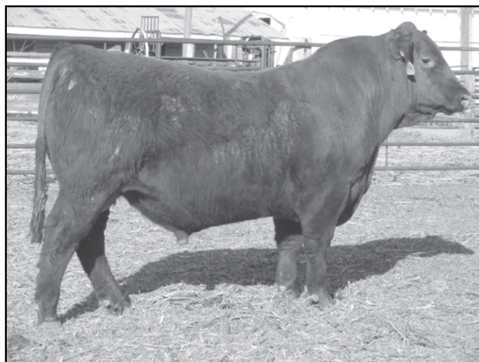
HXC Nytol 1003Y