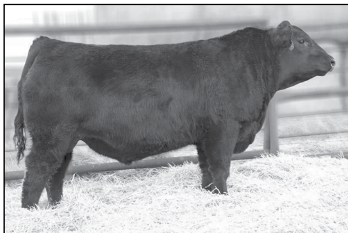
SSS Pay Dirt 357Z